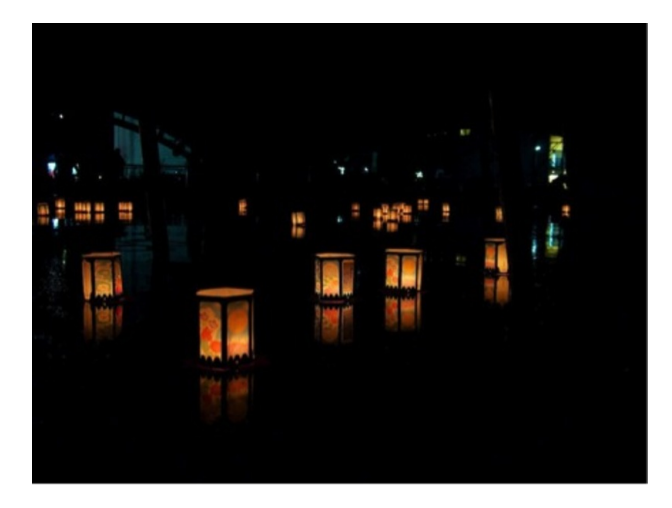
Obon lanterns bearing the names of tsunami victims, Kesennuma

The triple disasters of March 2011 have been described as a break with the past. The contributors to Japan since 1945 do not attempt to predict how those disasters will change Japan or the ways its history is already being told. But we are certain that, whatever directions Japanese take now - and they will most certainly not all take the same direction - they will be building on their pasts, particularly their experiences, accomplishments, and failures, as all societies always do.