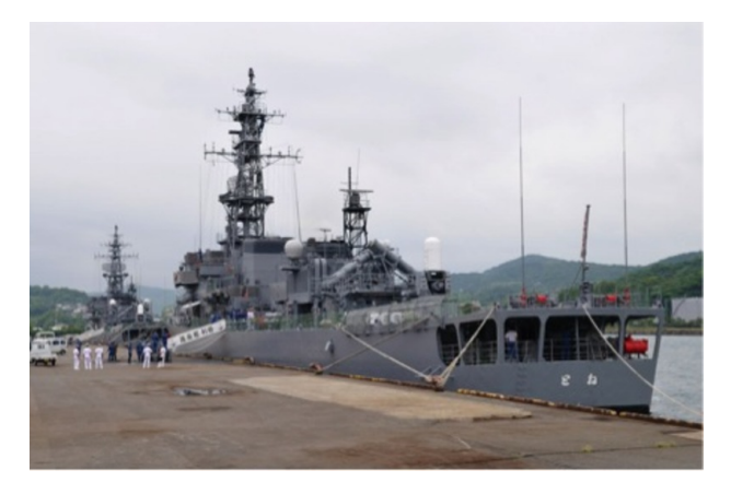
Maritime Self Defense Force Warships at Minamata

that Japan had never fully apologized for its actions.