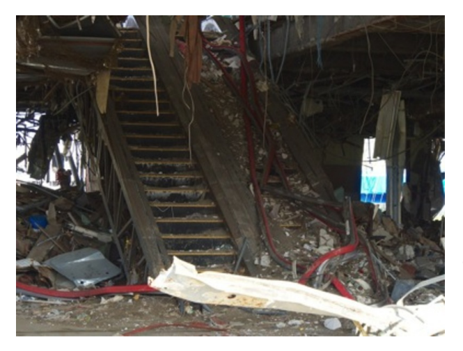
Store devastated by the March 11, 2011 tsunami, Rikuzentakata