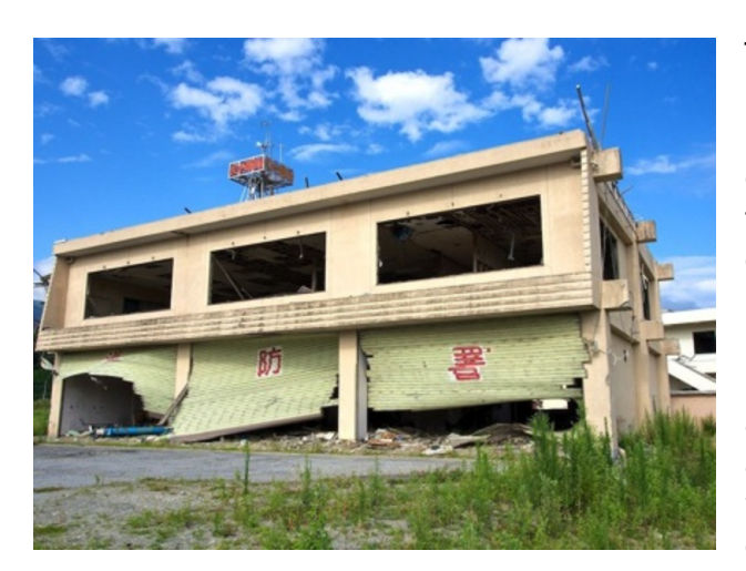
Firehouse devastated by the March 11, 2011 tsunami, Rikuzentakata

vigor and discover a new path and new purposes. The flurry of international attention, including a level of media coverage on Japan not seen since the early 1990s, again brought global interest to bear on Japan's economic and social woes. Yet the content of that analysis too often suggested that Japan's successes are relevant but its failures are unique. While financial reports seemed to regularly declare Japan "out of recession," media discussions in and outside Japan after March of 2011 remained haunted by the failure to bounce back from the devastation inflicted by one of the strongest earthquakes in recorded human history. The ruins of disaster provided further fodder for dismissing Japan as irrelevant on the international political stage. Reports of Japan's demise since 1990 remain wildly overstated, to the point that it has been quite fashionable to publicly wonder whether Japan really matters anymore.<sup>2</sup>