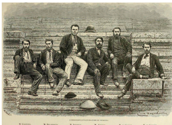
A Group Photo of the Mekong Expedition 2

Key members of the expedition were: 1. Ernest Doudart de Lagrée (captain, expedition leader, member of the Agricultural and Industrial Committee Cochin-China, entomologist), 2. Francis Garnier (lieutenant, inspector of Indigenous Affairs, mission leader after Doudart de Lagrée's death), and 3. Louis Delaporte (lieutenant, archaeologist, artist, art historian). 1