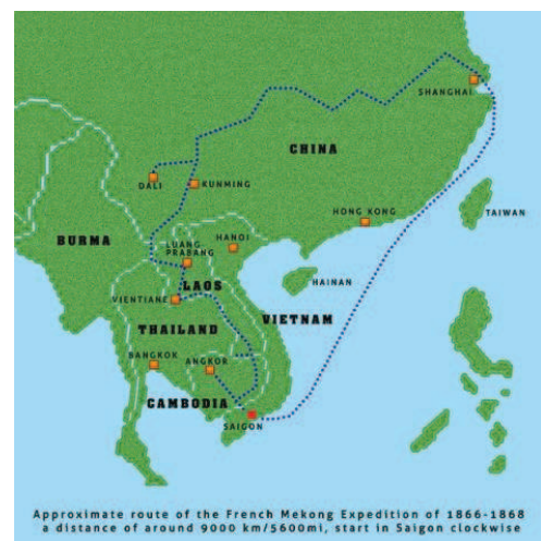
Route of the French Mekong Expedition map 3

The commission left Saigon on 5 June 1866. They spent nearly four months between June and September 1867 on their exploration in the Kengtung State of the Upper Mekong Region, much longer than they wanted or intended to be, mainly due to the unexpected or underestimated problems they faced with regard to their travel documents for passing through the region, as shall be discussed further below.