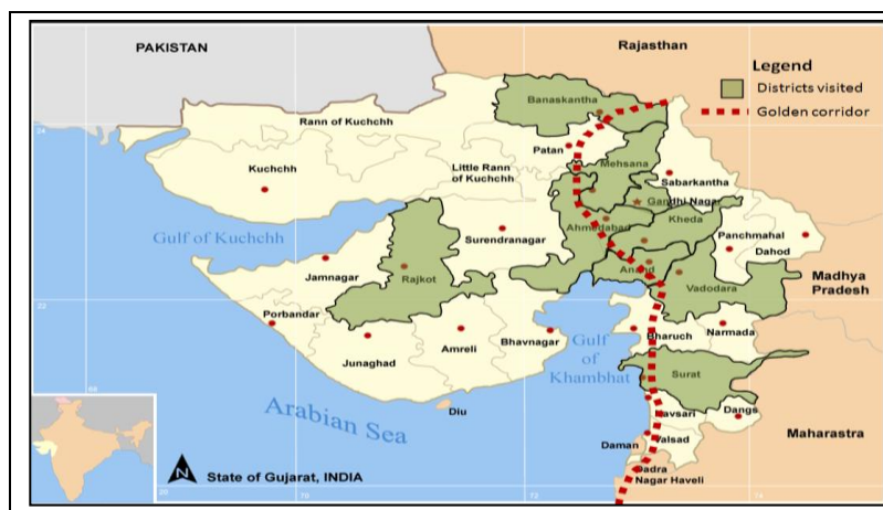
Figure 5.1. Map of Gujarat showing districts visited and the golden corridor