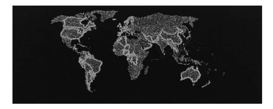
FIGURE 11: Tiffany Chung, Reconstructing an Exodus History: Boat Trajectories, Ports of First Asylum and Resettlement Countries, 2017, embroidery on fabric, 135 \times 340 cm.

Trương Tân and Tiffany Chung may prompt the question of whether Đổi Mới in the arts has really taken place.