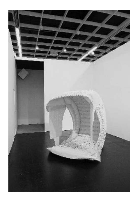
FIGURE 9: Trương Tân, Hidden Beauty, 2007, iron, cotton ball, fabric, buffer pads, dimensions variable.

after 2000, enabled the effects of global networking, research, and new platforms for art criticism.