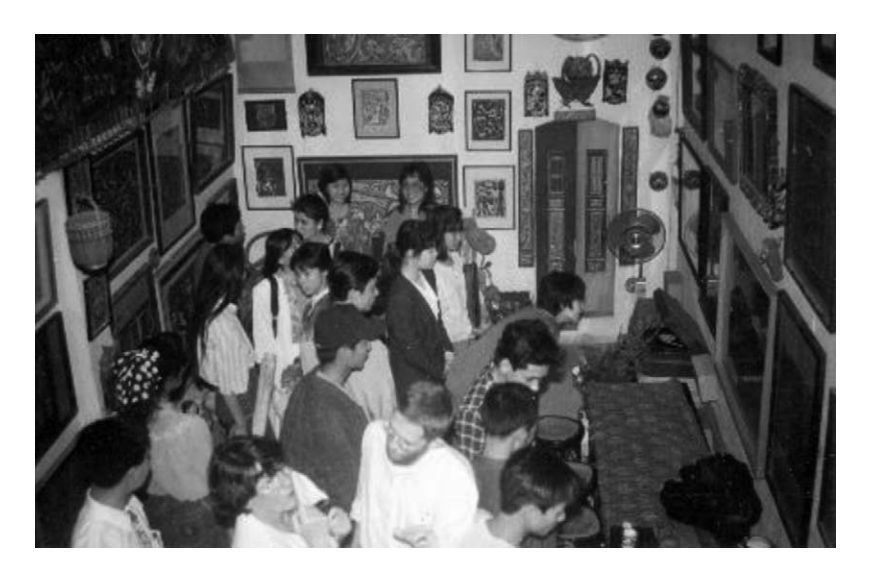
FIGURE 6: Salon Natasha, 1994.

Natasha's activities sponsored by the Asia Art Archive in Hong Kong, Salon Natasha is being reconsidered as a site of artistic experimentation and reform in the last decade of the twentieth century.20