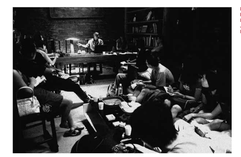
Discussion at Long March Education residency at the Long March Space, Beijing, in July 2009.