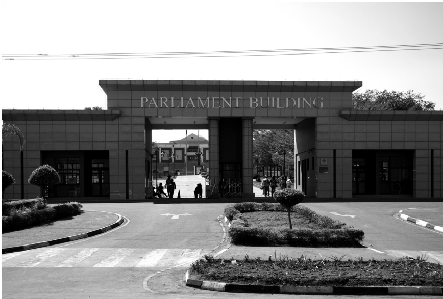
Figure 3.1 Entrance of the Malawi Parliament building in Lilongwe (Innocent Batsani-Ncube, July 2019).

consists of three constituent parts, namely the reception checkpoint (figure 3.1), the amphitheatre and the main building that houses the debate chamber and offices. The most visible part to the ordinary citizens is the reception checkpoint manned by soldiers and other security personnel to regulate entry and exit. The checkpoint is in front of a well-manicured lawn and flower beds and faces the busy Presidential Way, Lilongwe's main boulevard which takes one to the Kamuzu Presidential Palace to the east and into the residential areas to the west. It is in the form of a flat-roofed structure clad in shiny Chinese grey tiles, with the centre that marks the high point of the roof inscribed with the words 'Parliament Building' in gold and with pillars on each side.