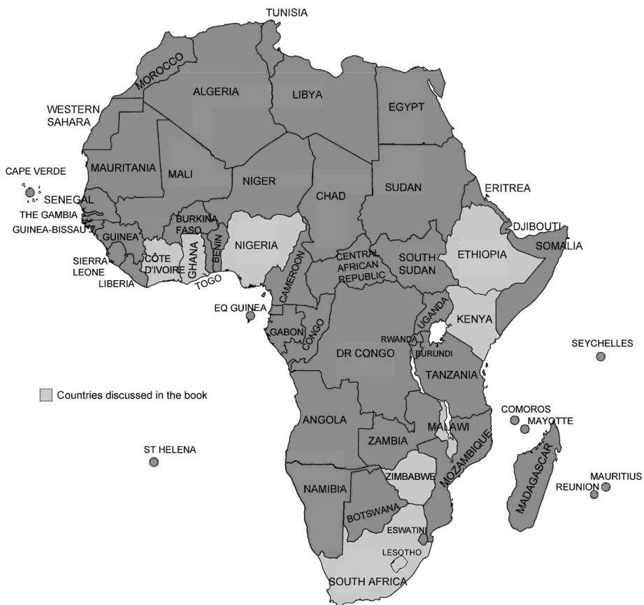
Map 0 Map of Africa highlighting the countries discussed in this book (Sunil Pun, November 2021).