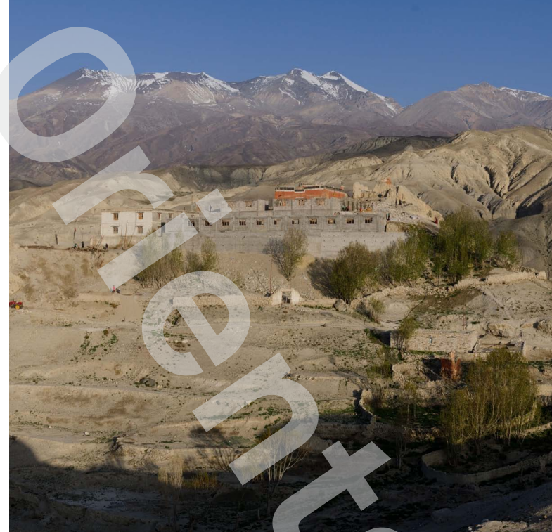
Fig. 3 View of Namgyal monastery during the construction of the new monastic quarters in 2013

Nevertheless, the heritage of portable artworks preserved in situ has largely remained unknown. In part, this is due to the ongoing restrictions on photography imposed in the region for the interiors of temples and monasteries, but research interests may also have been at play. In fact, so far no research has been conducted on historically grown monastery collections, even though their composition, assembly, maintenance and display are important aspects of Tibetan Buddhist practice. Such collections not only