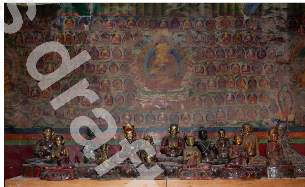
Fig. 4 Part of the left side wall of the Namgyal temple with the Buddha Maitreya in the murals and some of the larger papier-mâché sculptures placed along the wall

Since my first visit, Namgyal monastery has changed significantly. The Lamdre Lhakhang I saw in 2010 was destroyed in spring 2012 to give way to an enlarged monastic courtyard in front of the main temple. This work, driven by the energetic abbot Khenpo Tsewang Rigzin (Fig. 2), has substantially altered the character of the monastery, replacing the traditional clay brick structure with a concrete one—the choice being a condition of the development funding received from the Indian government. The monastery has also grown, expanding the monastic quarters by a new front portion (Fig. 3). Of course, it is a pity that the organic and traditional structure had to give way for a larger, displaced-looking concrete building in direct view of Lo Manthang, but a final assessment of this change must await the completion of the construction—right up to and including the painting of its walls.