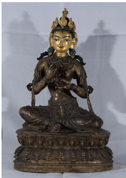
Fig. 7 Goddess Nairatmya, Lamdre lineage set of Tsewang Zangpo Mustang, late 15th century Metal alloy with silver, copper and turquoise inlays, 30 x 19 x 14 cm Namgyal monastery