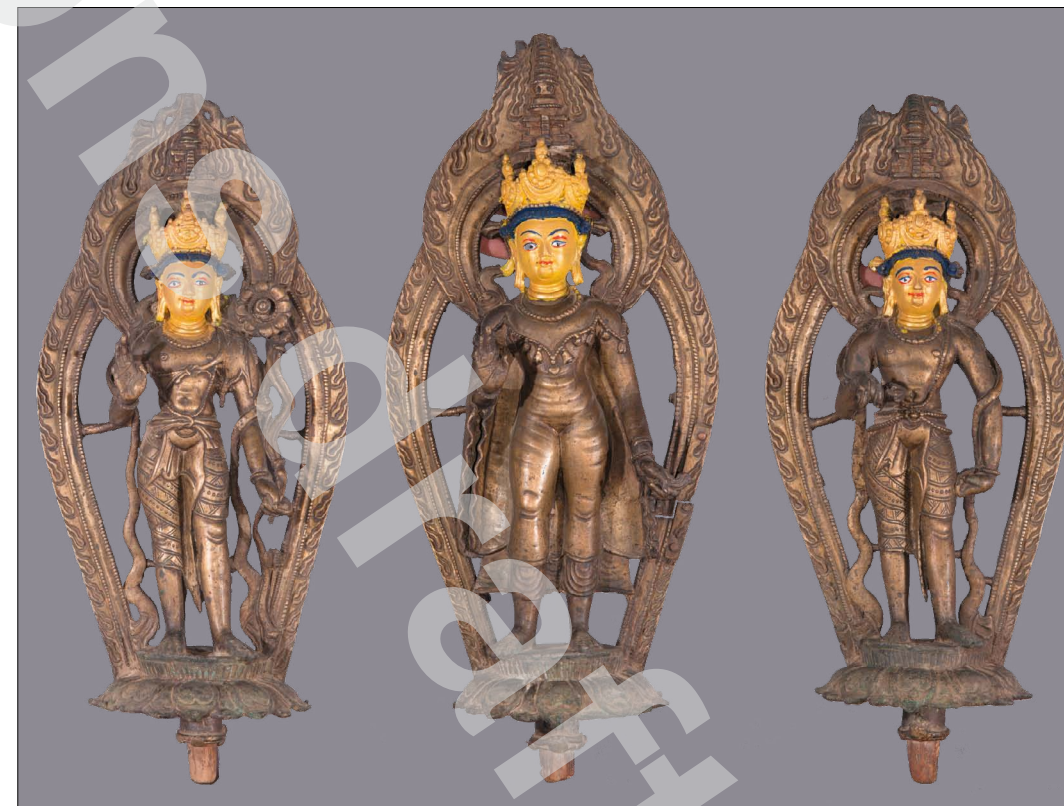
Fig. 6 Three-family triad with (from left) the bodhisattva Avalokiteshvara, the historical Buddha, Shakyamuni, and the Buddha Vajrapani West Tibet, 11th century Metal alloy, (from left): 38 x 17 x 8 cm, 39 x 18 x 8.5 cm, 37 x 17 x 8 cm Namgyal monastery

Originally, the collection was displayed in two areas, the main assembly hall and the Lamdre Lhakhang. By the time I was able to photograph the interior of the temple in 2012, the sculptures of the Lamdre Lhakhang had been moved to the Assembly Hall, literally overcrowding it. For security reasons, all metal images were assembled in the three windowed areas of the altar (Fig. 5), while the papier-mâché sculptures were placed on improvised furniture along the walls (see Fig. 4). Thus, at that stage the location