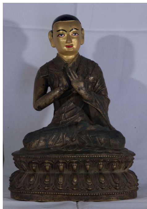
Fig. 10 Fourth abbot of Ngor Kunga Wangchuk (1424–78), Lamdre lineage set of Tsewang Zangpo Mustang, late 15th century Metal alloy with silver and gold inlays, 29 x 19 x 14 cm Namgyal monastery

of the sculptures was only defined by material and size.