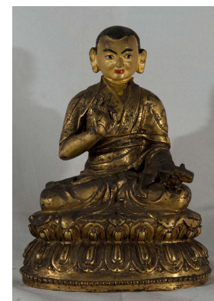
Fig. 12 Drogmi Lotsawa Shakyas Yeshe (992–1072) commissioned by Lodro Gyaltsen Mustang, late 15th century Gilt bronze, 19 x 14 x 11 cm Namgyal monastery

The most valuable of these are three 11th century sculptures from West Tibet forming a triad of Shakyamuni flanked by Avalokiteshvara and Vajrapani (Fig. 6). This triad was originally attached to one stand that is not preserved, which made the photography of the figures rather challenging. Slightly larger than the other images, the central Shakyamuni wears a triple crescent crown and a three-pointed cape, both features adopted from earlier Kashmiri examples. Avalokiteshvara holds a large lotus in his left hand at the stalk, and Vajrapani holds an only half-preserved vajra horizontally in his right. Together these images