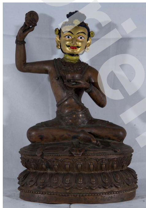
Fig. 8 Mahasiddha Damarupa, Lamdre lineage set of Tsewang Zangpo Mustang, late 15th century Metal alloy with silver and gold inlays, 29 x 19 x 14.5 cm Namgyal monastery