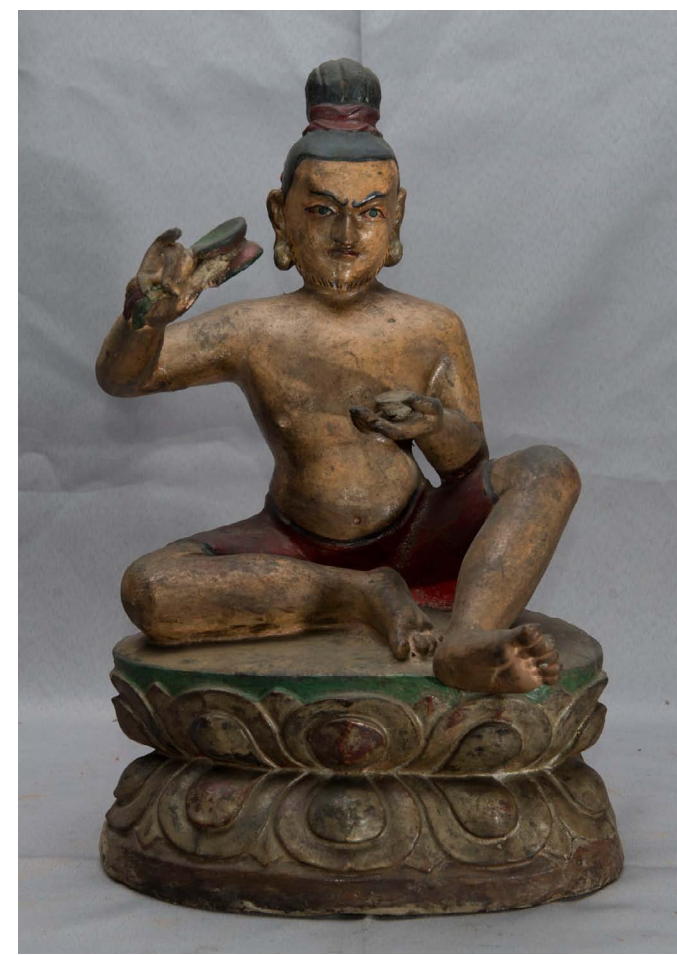
Fig. 14 The great adept Damarupa Mustang, 15th–16th century Papier-mâché, 34 x 24 x 15 cm Namgyal monastery

The lineage does not go back to the original