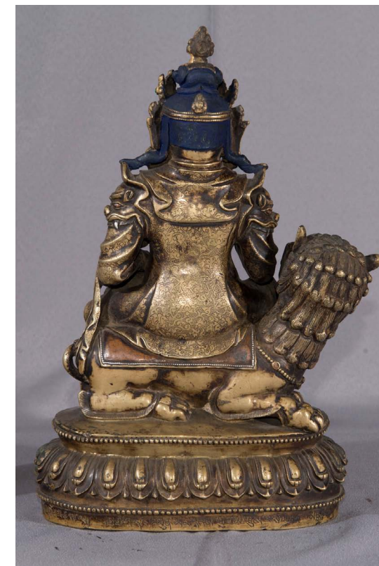
Figs 11a and b Front and back views of the wealth deity Vaishnavana commissioned by Tsewang Zangpo Mustang, late 15th century Metal alloy with silver and gold inlays, 30 x 20 x 12 cm Namgyal monastery