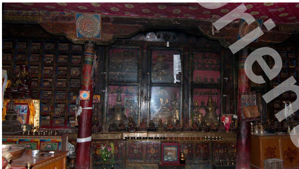
Fig. 5 Interior of the Namgyal temple in 2012, with the metal objects behind glass and the books in the flanking shelves

In spring 2015 Namgyal village and monastery suffered substantially in the earthquake and its aftermath. The lantern of the main temple, the only building remaining from the old complex, collapsed and crashed into the assembly hall, and the beams supporting the roof shifted. This damage resulted in the abandonment of the structure, and plans are under way to replace it with a new construction. All sculptures were moved to the building housing the caretakers, which was constructed within the last two decades. The rear part of this building was also damaged, and the books found a temporary shelter in one of the rooms of the new monastic quarters. It was not possible to continue construction in 2015; the Namgyal monks remained at their winter quarters near Pokhara, and the monastery was staffed only by caretakers, along with the usual fearsome watchdogs.