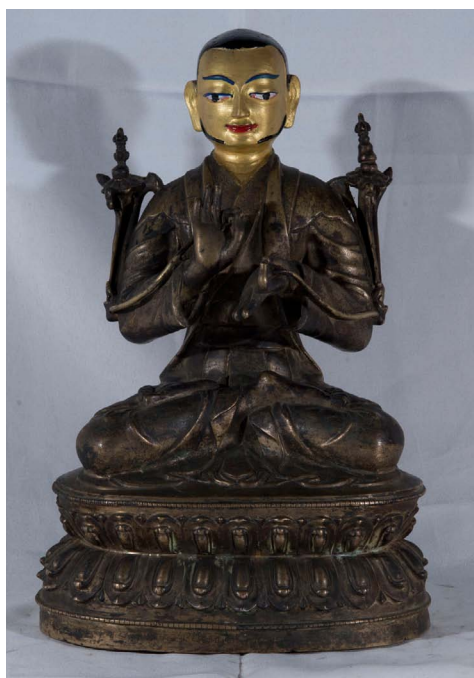
Fig. 9 Sakya master Sönam Tsemo (1142–82), Lamdre lineage set of Tsewang Zangpo Mustang, late 15th century Metal alloy with silver and gold inlays, 28.5 x 19 x 14 cm Namgyal monastery