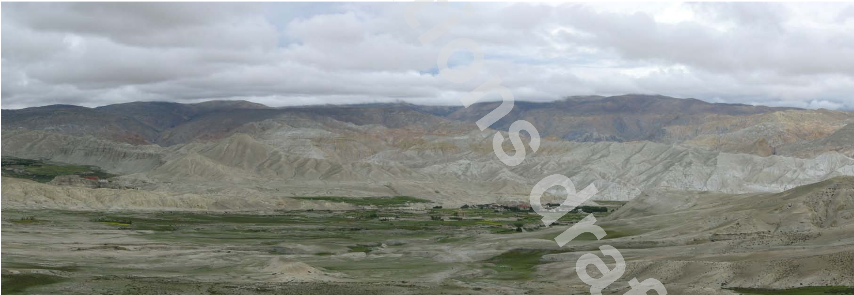
Fig. 1 View of Upper Mustang with Namgyal monastery on the left and Lo Manthang on the right

During four visits since 2012, the first three of them funded by the Rubin Museum and one by Heritage Watch International, I documented six monastery collections, photographing and measuring each object. The most important among the collections documented so far is that of Namgyal monastery, introduced in this article (Fig. 1). While the exhibition project is currently on hold, the documentation intended to contribute to the preservation of this precious heritage in the region continues.