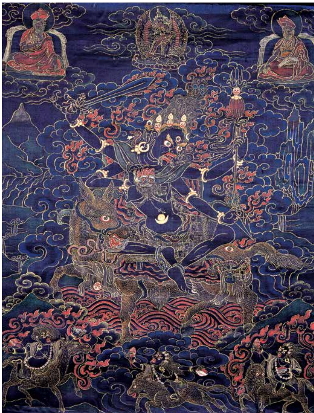
5 Glorious Goddess Palden Lhamo. Bhutan, late 18th century. Pigments on cloth (silk?); 68.58 x 58.42 cm. Rubin Museum of Art, F1998.1.2 (HAR 602).

The clouds are clustered and have prominent tails directed towards the sides of the canvas. Tails are vaguely discernible in some clouds in figure 4, but here their conception is remarkably different. Certainly, the two paintings derive from different temporal or geographical contexts, the exact nature of which needs further clarification.