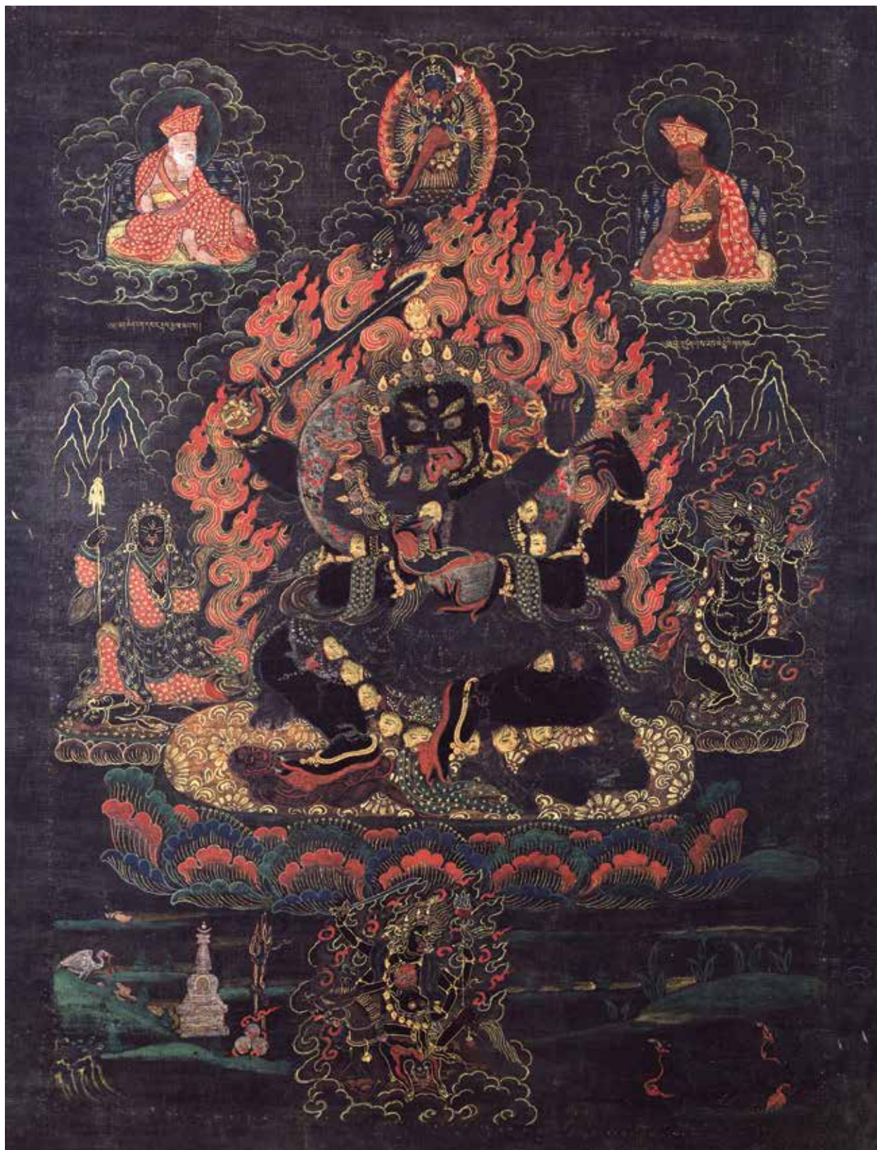
6 Four-armed Mahakala. Bhutan, late 18th century. Pigments on cloth; 68.10 x 48.74 cm. Rubin Museum of Art, c2006.66.146 (HAR 115).