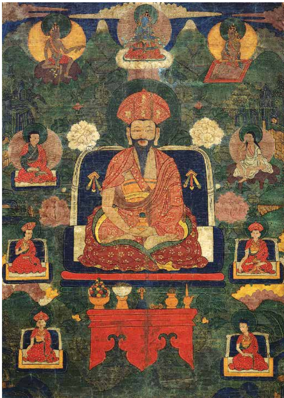
3 Zhabdrung Ngawang Namgyal (1594–1651). Bhutan, mid-19th century. Ground mineral pigment on cotton; 98.42 x 77.15 cm. Rubin Museum of Art, c2006.66.248 (HAR 360).

the one on the right rides a horse, wears armour and attacks with a spear. These possibly are two local protectors associated with the area of Punakha, namely Damchen Gomo, the protective deity of Gönyül and the northern Punakha valley, 17 and Tsenchen Jagpa Melen, the warrior deity of the kingdom of Bhutan. 18