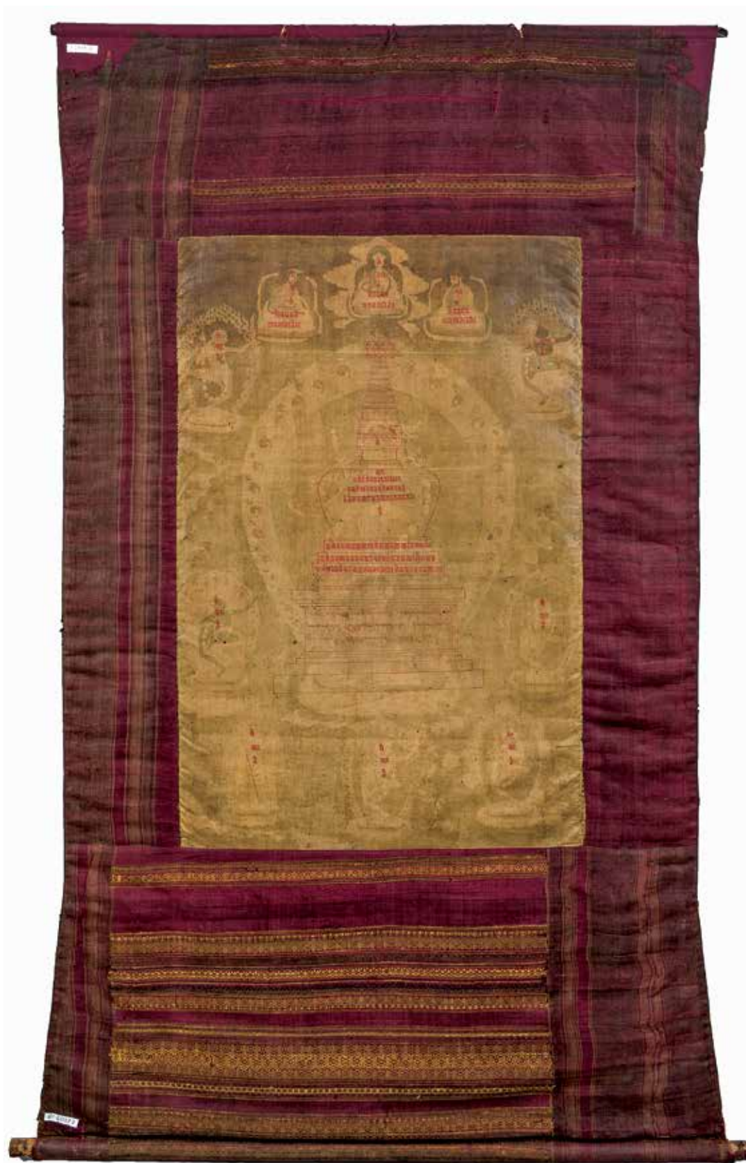
2 Back of the Vajravarahi thangka in figure 1.

been imported and thus not be reflective of Bhutanese painting at all.