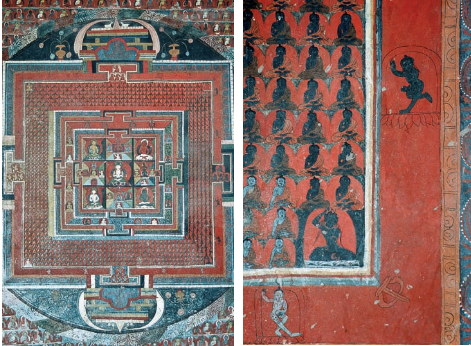
Fig. 10: Durgatipariśodhana mandala with the Buddhas in the cardinal direction repeatedly represented; Alchi Tsatsapuri, eastern temple, ground floor, left side wall; photo C. Luczanits 1998 123,21 (WHAV).