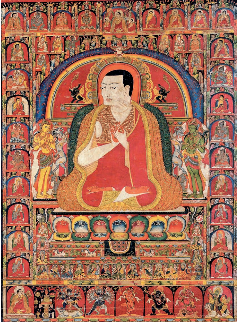
Fig. 5: The Stag lung hierarch and founder of Ri bo che Sangs rgyas dbon po (1251-1296) on a painting of the mid-14 th century; Musée Guimet, MA 6063