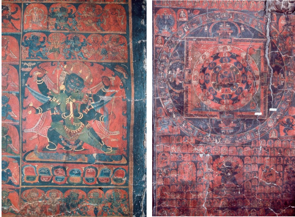
Fig. 6: Vajrakīlaya assembly from the Bka' brgyad; Wanla temple, left side wall to the right of the Maitreya niche; photo C. Luczanits 2003 12,18.