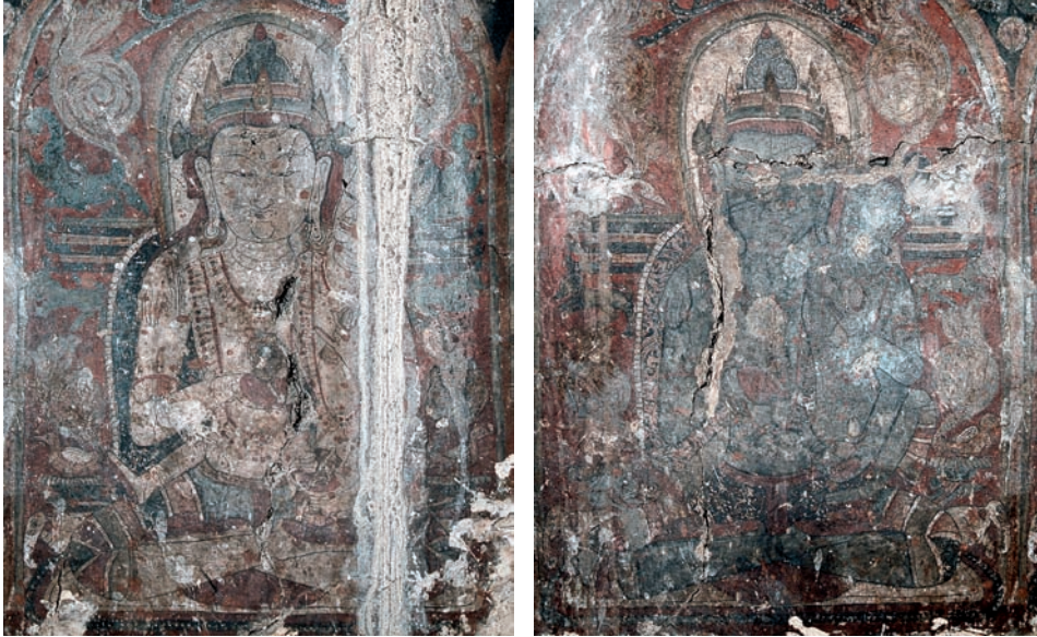
Fig. 1: Vairocana with prajñā holding a wheel and a bell, the central figure in the group of the five jina ; Wanla temple, west wall of the lantern; first half of the 14 th century; photo C. Luczanits 2003 6,17.