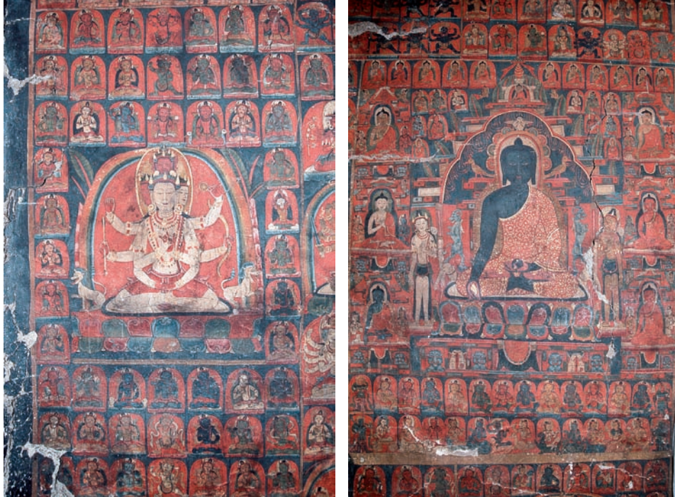
Fig. 8: Assembly of an eight-armed Vajradhātu Vairocana; Wanla temple, main wall to the left of the main niche; photo C. Luczanits 2003 11,01.