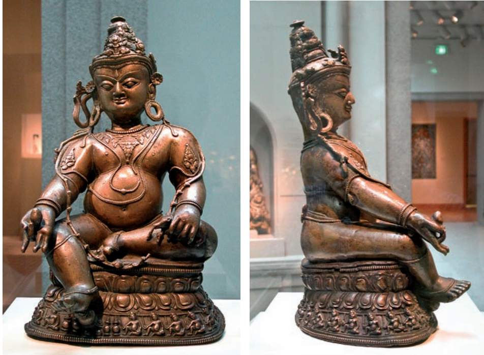
Fig. 12: Jambhala with vases and repeated representations of himself in male and female form (eight each) on the lotus throne; Central Tibet, 14 th century; bronze with traces of pigment, 41.0 x 25.0 x 23.0 cm; courtesy of Arthur M. Sackler Gallery, Smithsonian Institution, Washington, D.C.: Purchase, S1996.39; photo C. Luczanits 2001 (D2913).