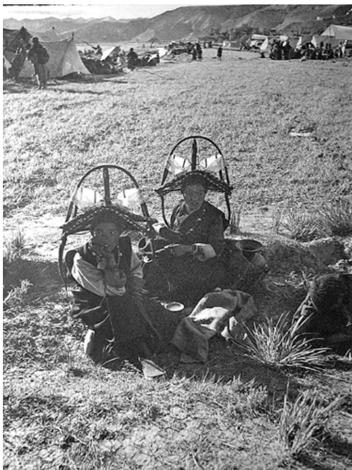
(Fig. 2) Women with the traditional Gyantse headdress resting in a field