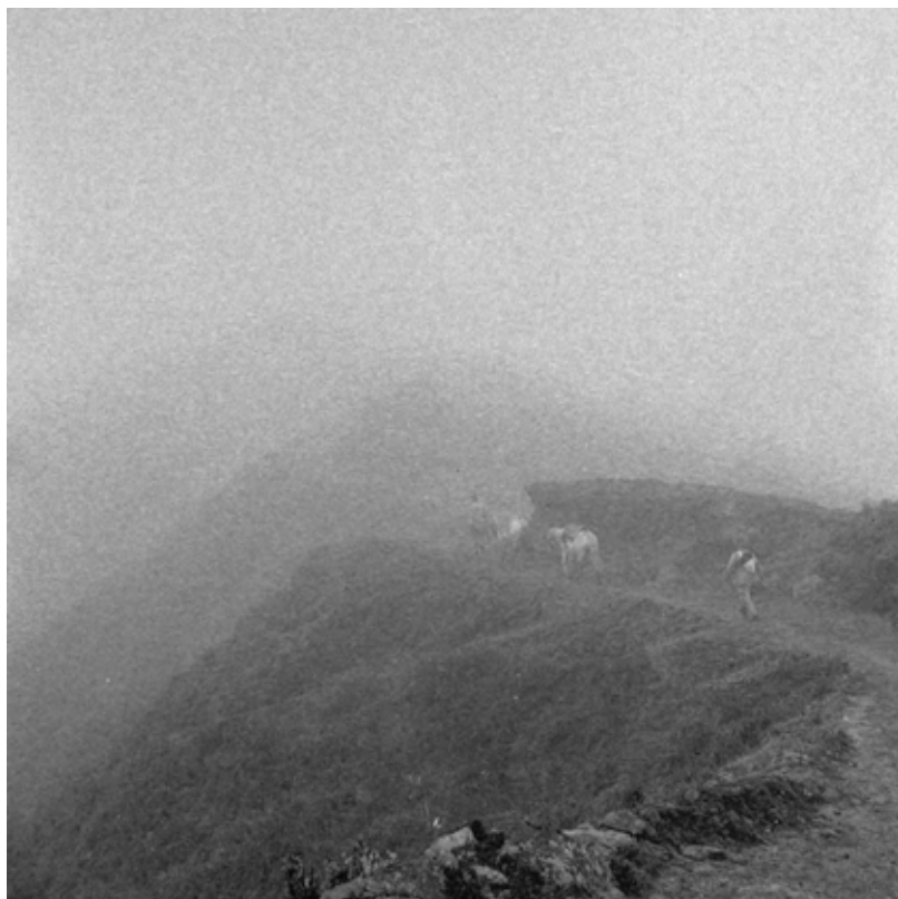
(Fig. 1) The caravan disappearing in fog

This collection alone shows how much the British government representation – which even established dak bungalows en route that were also used to facilitate travel – became the focal point of access to ‘mystical’ Tibet. The British presence also enabled Americans to gain entry, among them Theos Bernard (1908-47), whose collection of artefacts and photographs is now housed at Berkeley Art Museum, and the two travellers whose photographs are the subject of this article. One may well see this arrangement as the beginning of tourism in Tibet, even if it was very exclusive.