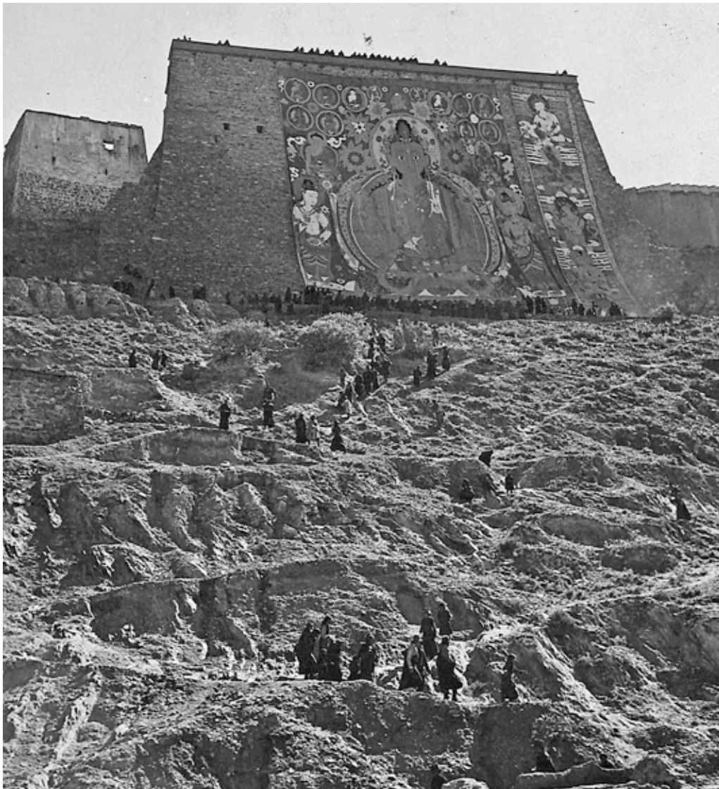
(Fig. 5) Giant cloth thangka unrolled at Gyantse