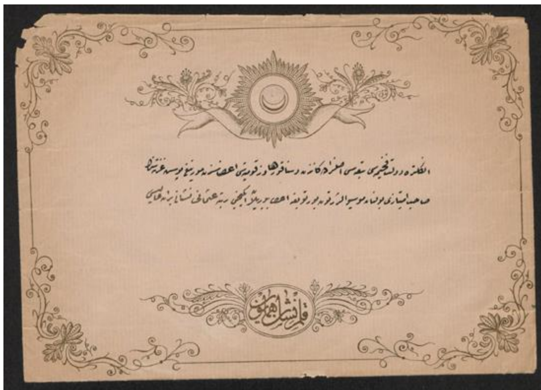
Fig. V : Imperial Order of the Osmanié, 2 nd class, awarded to Algernon Borthwick.