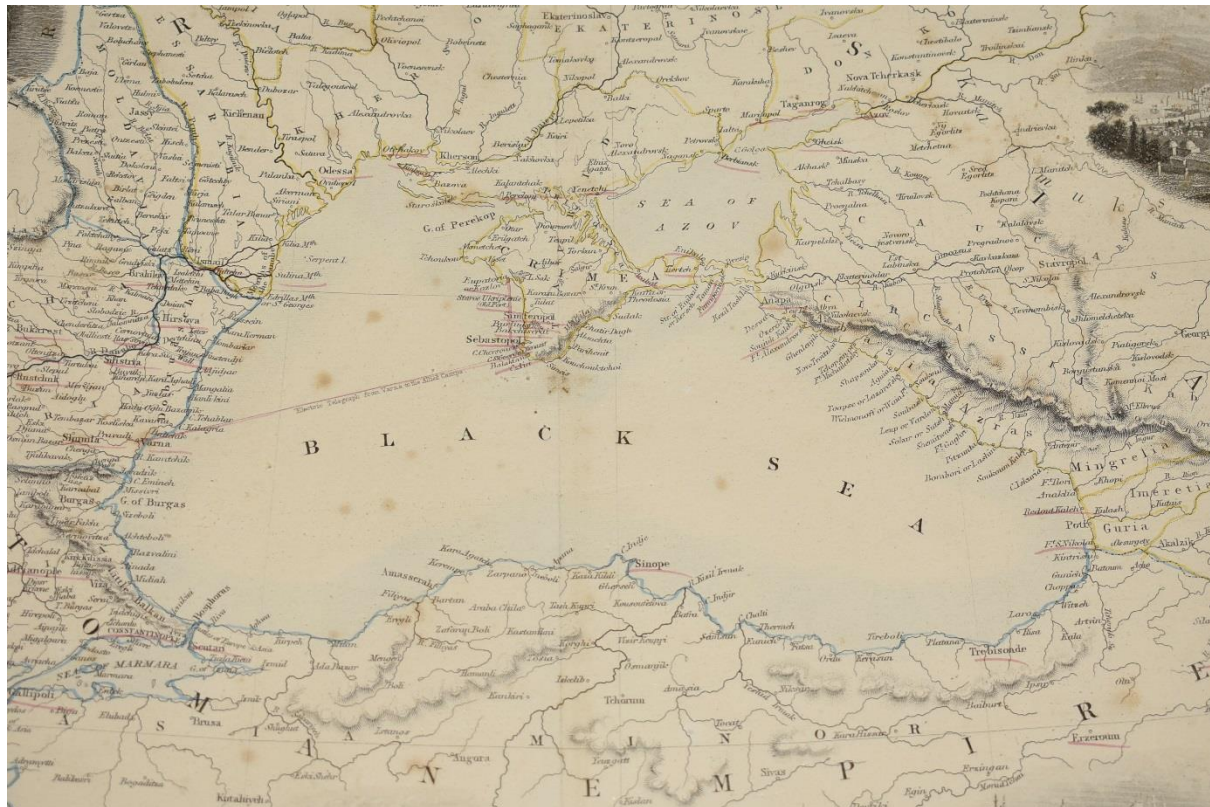
Fig.III Black Sea Antique Engraved Hand-Coloured Map, drawn & engraved by J. Rapkin. (Publisher: London H. Wrinkles, J. Rapkin. 1851).