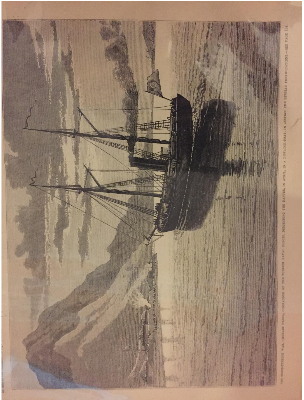
Fig.IV Russo-Turkish War. Hobart Pasha, Commander of the Turkish naval forces, descending the Danube, in April, in a despatch boat, to inspect the Russian fortifications.