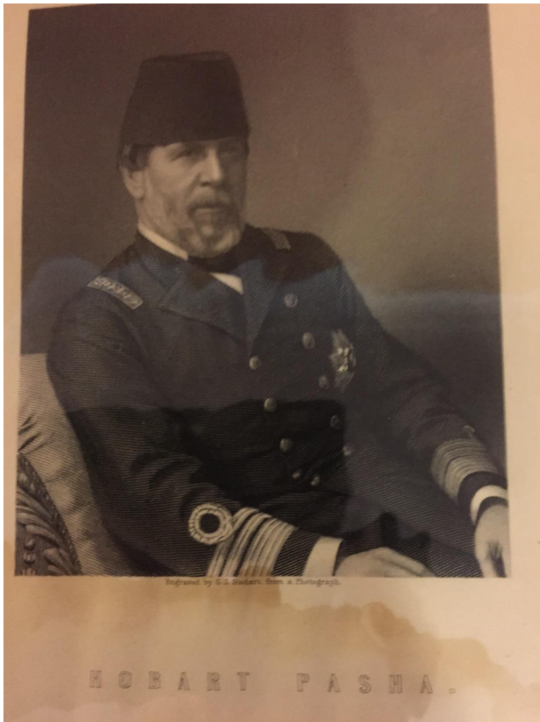
Fig. I: Hobart Pasha; Engraved by G. I. Stewart from a Photograph