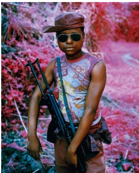
Figure 3: Richard Mosse, 'Rebel Rebel' (2011)

through the interplay of a subject's agency and the photographer's goals, the complex and ongoing social life of the Congolese is systematically removed from the photographic frame, rendering the depictions of suffering and arms-wielding violence prominent in representations of what Congo is, and for over hundred years, has been (Graham, 2014: 141).