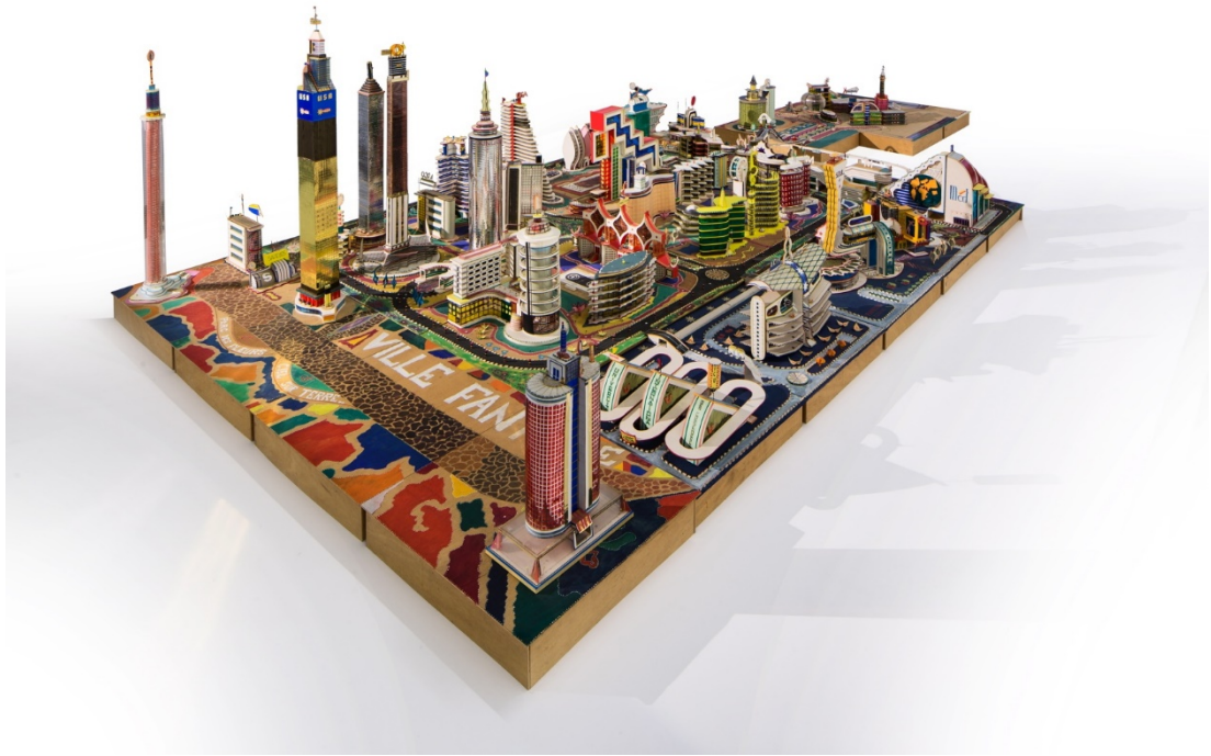
Figure 9 Ville Fantôme (1996)

restorative sensibility and reconstructive aesthetic emanating from the unrealized promises of Congo's independence.