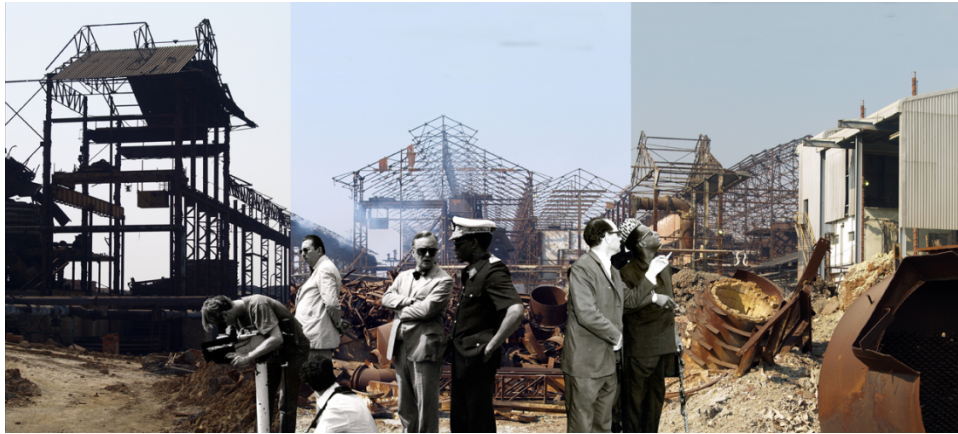
Figure 5: Sammy Baloji, Untitled #25, (2006)

Baloji's focus on history and storytelling is in direct opposition to the media's coverage with its images of Africa which typically switch between rapturous narratives of development, or stereotypical images of inexorable conflict and political corruption. His attentiveness towards the continuing legacy of colonisation eschews these insidious narratives.