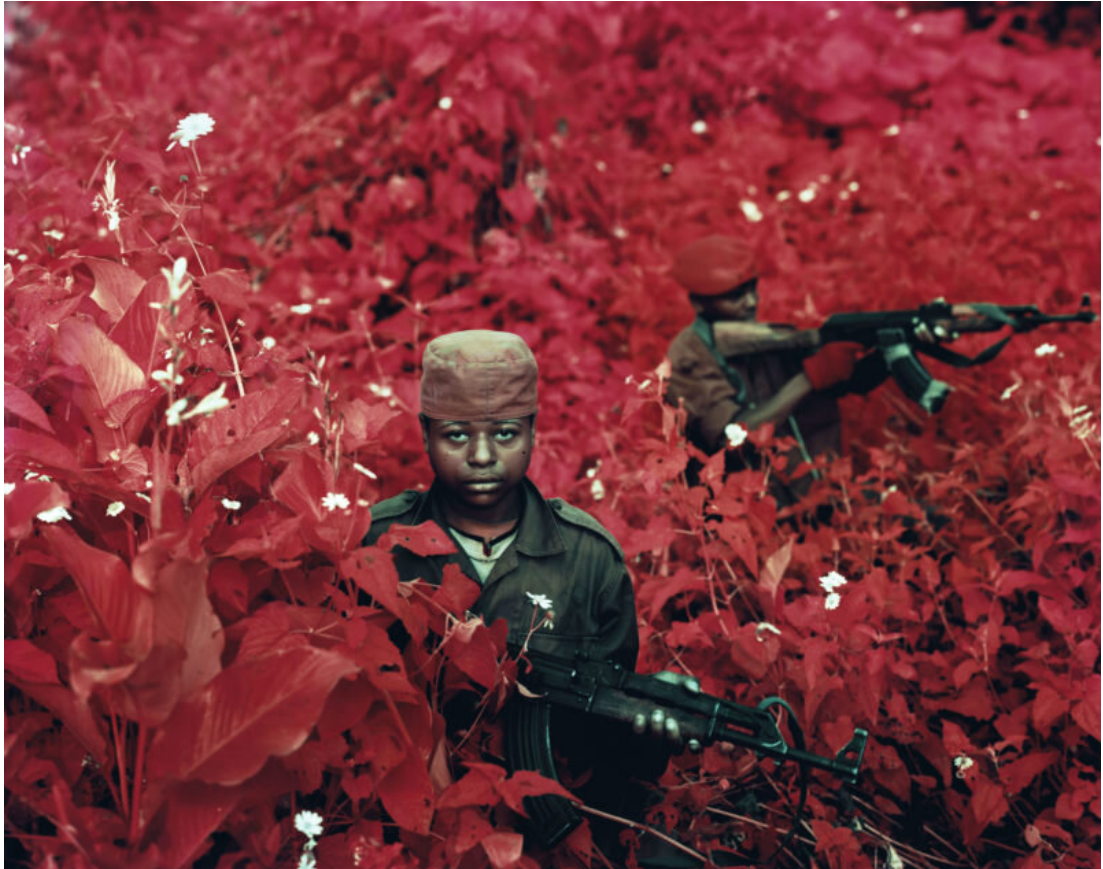
Figure 1: Richard Mosse 'Vintage Violence' (2011)

the impossibility of any meaningful political process in addressing the causes of the conflict if the combatants involved are ruled by nothing more than caprice. Henceforth, the impotence of politics in the face of conflict is transformed into an opportunity for the artist.