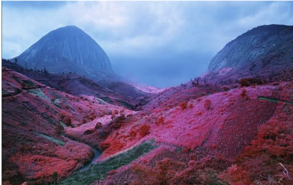
Figure 2: Richard Mosse 'Poison Glen' (2012)

The unpopulated stillness of The Poison Glen gives the viewer the sense that we are witnessing the aftermath of military strike or natural disaster. The strange red pinkish glow of the image is suggestive of the fallout of an ecological catastrophe or a post-nuclear apocalypse. The disturbing effects of these images brings to the fore the original function of this technology and the 'cultural memory of wilful destruction' in the American bombing campaigns in Vietnam, Cambodia and Laos (Brancaleone, 2013). Mosse's decision to use the Kodak Aerochrome technology originated in his own struggle with his position as a European man and the traditional form of conflict photography and photojournalism: