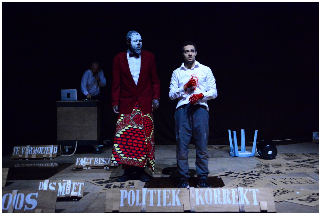
Figure 8 Kuzikliza (2019)

changes to urban metropolitan life throughout the 1970s and 80s. In 1977, he started to experiment with models of the city fashioned from everyday materials that ‘offered a redemptive model of the city’ (“Bodys Isek Kingelez - Pigozzi Collection 2021,” n.d.). His sculpture Ville Fantôme (1996, figure 9) reconstructs the postcolonial city in utopian fashion but underlines its fantastic and spectral aspect, evoking an ‘unease’ (Enwezor cited in Wiesenberger, n.d: 84) within the spectator at our sense of alienation from this scene of urban utopia as a perfectly balanced and harmonious urban ecosystem. The city beguiles the viewer with the everyday materiality of its constituent parts and construction and the overall unworldly and utopic affect it achieves.