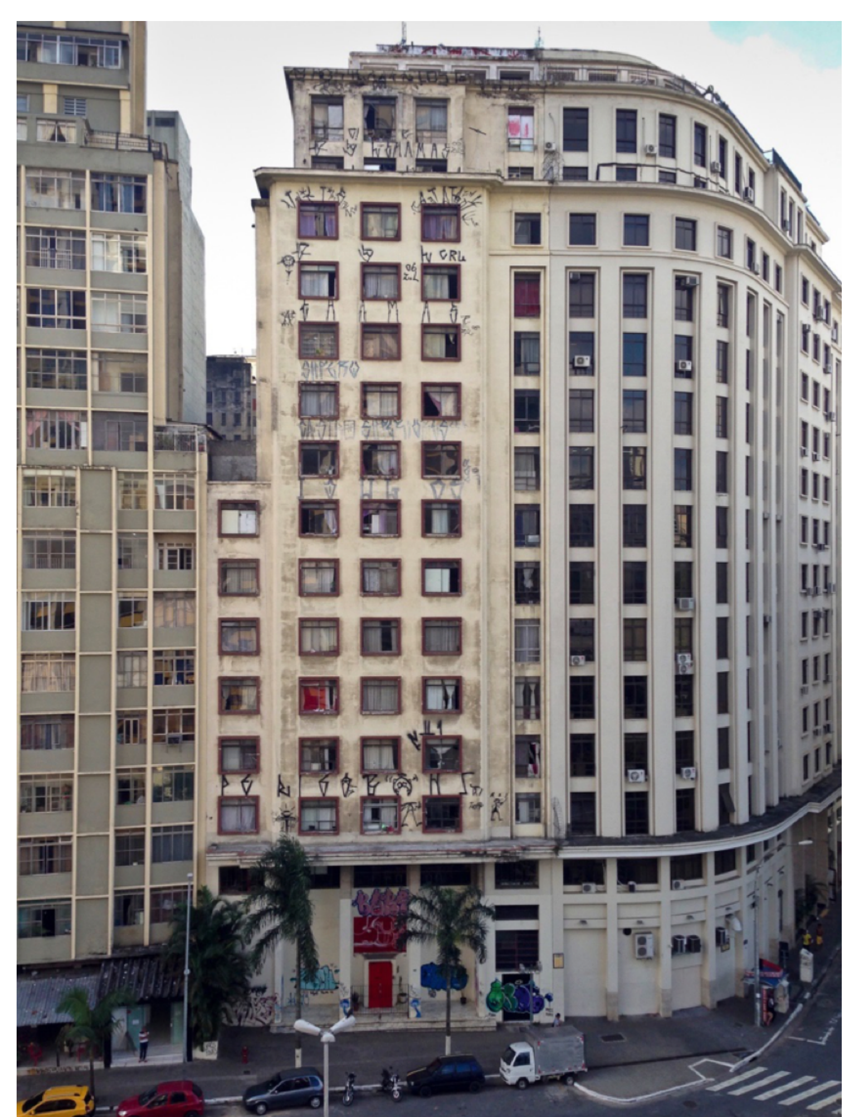
Figure 3. Front, Occupation Hotel Cambridge PLURAL, Revista do Programa de Pós-Graduação em Sociologia da USP, São Paulo, v.25.2, 2018, p.20-45