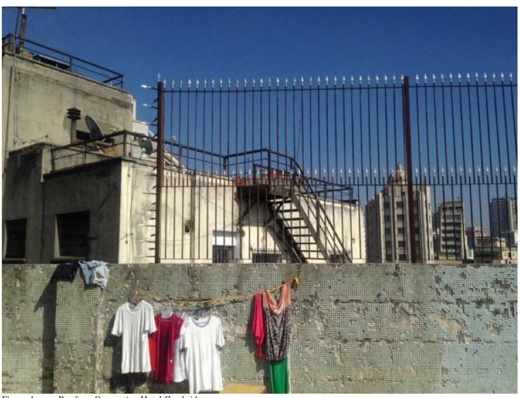
Figure 4. Rooftop, Occupation Hotel Cambridge