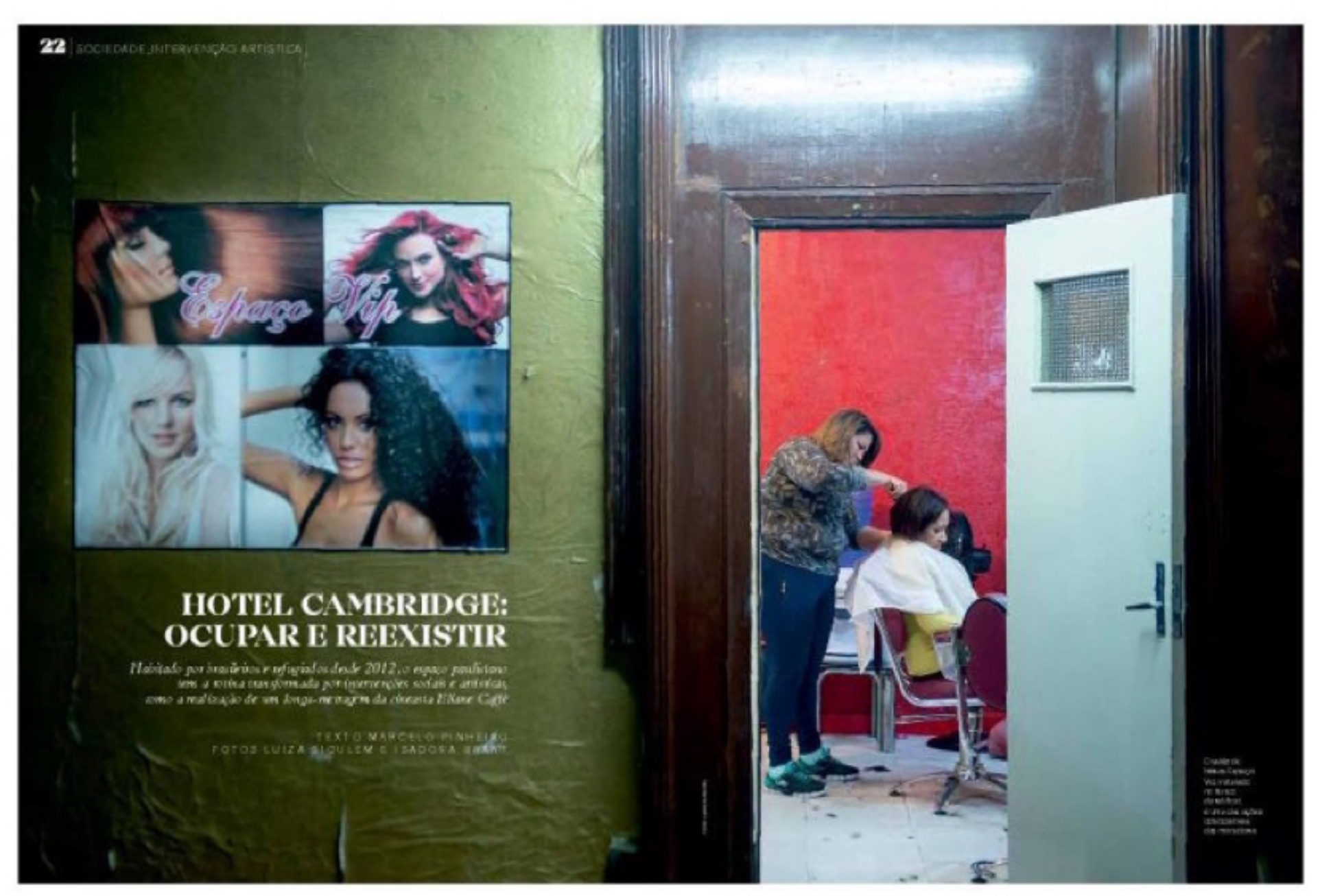
Figure 5. Occupants, Occupation Hotel Cambridge