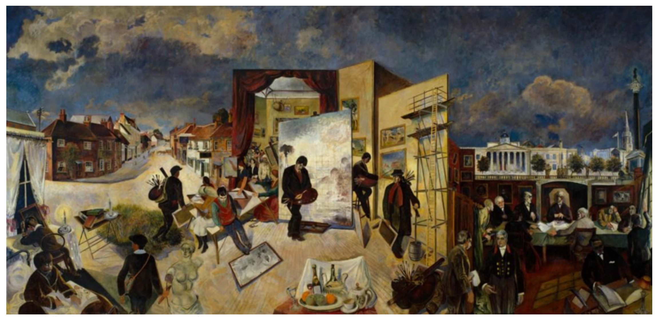
Figure 1. Gilbert Spencer, An Artist's Progress, 1959

I would like to open up this paper by challenging the idea that "mobility has become the paradigm of our times."[1] In fact, has it for artists?