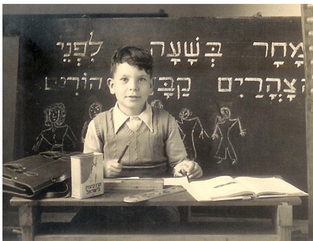
Fig. 6. JNF donation box in a Israeli classroom, 1954.

The map has a visual, tactile and real presence in Israeli everyday life, achieved through myriad instances of inscription.