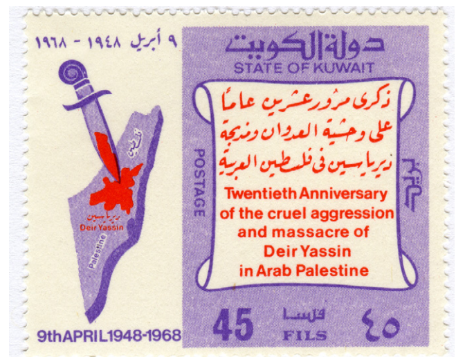
Fig. 7. 1968 Palestine commemoration stamp, issued by Kuwait.

Against this background of displacement, denial, fragmentation and political dismemberment, the Palestinian national movement was reborn as a new generation attempted to come to terms with the 1948 trauma. Their mission was to make refugees into a modern nation, through political activism and armed struggle (Sayigh, 1997). A nation, as Winichakul has argued, requires a geo-body, a clear geographical shape to which it can refer, which often emerges following national trauma and loss of territory (Radcliffe & Westwood, 1996; Winichakul, 1994). The map of Mandatory Palestine was the Palestinian geo-body, acting as a symbol of Palestinians’ unity and independent standing as a nation. As of the early 1960s, the map appeared in Palestinian visual art (Tibawi, 1963) and on Arab stamps, issued to support the Palestinian cause (Fig. 7) (Wolinetz, 1975). All major Palestinian political organisations, from the secular Fatah, through leftist Popular Front, to Islamist Hamas, incorporated the map of Mandatory Palestine into their logos, stationery, and posters. Against the Israeli denial of