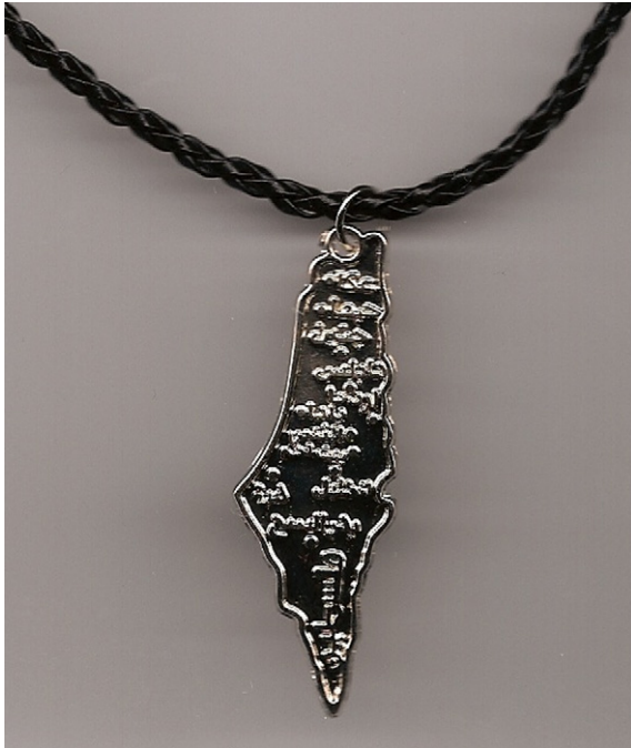
Fig. 2. Necklace with the Palestine map, with names of Arab cities. Jewish cities, most notably Tel Aviv, do not appear on the map.