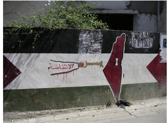
Fig. 8. Graffiti of the map of Palestine, Ein al-Hilwe Refugee Camp, Lebanon, 2005.

But the map does not only commemorate Palestinian martyrs: it also commemorates the 1948 loss of Palestine, and alludes to the hope for Palestinian Return. Already in the 1950s, school maps used in refugee schools were overprinted with captions "verily we are returning" (Tibawi, 1963). In various representations, the map is accompanied with images of refugees awaiting to return to Palestine, or with their symbolic keys of the lost homes (Fig. 8). The map acts as a visual embodiment of the Palestinian "Right of Return", which is the very basis of Palestinian nationalism, and the centrepiece of Palestinian political mythology (Bowker, 2003; Peretz, 1993). What often escapes commentators is that the "Right of Return" transcends the refugees' demand to return to their ancestral villages and towns; it also includes a return to their geography and history books; a return to international recognition