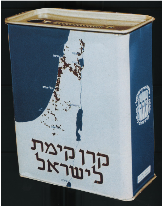
Fig. 5. JNF box, manufactured in 1934.

that provided depth to modern Jewish national identity. The act of narrating always involves a selective approach to events, places and historical facts; the narrating of the map highlights a certain story about the landscape, while suppressing other stories. The double project of rewriting and erasing was examined in Meron Benvenisti's (2000) illuminating study of the 1950s Israeli campaign to rename the Negev region. A committee of learned scholars was formed to assign Hebrew names to the geographical sites and features of the Negev region, choosing biblical, pseudo-biblical and historical-sounding names, with limited scientific justification. The Arab character of the landscape was removed on a symbolic level: of original 553 Arab names, only 8 were left unchanged, as part of the delegitimisation of Arab rights over the country (see also Peled-Elhanan, 2008). The new