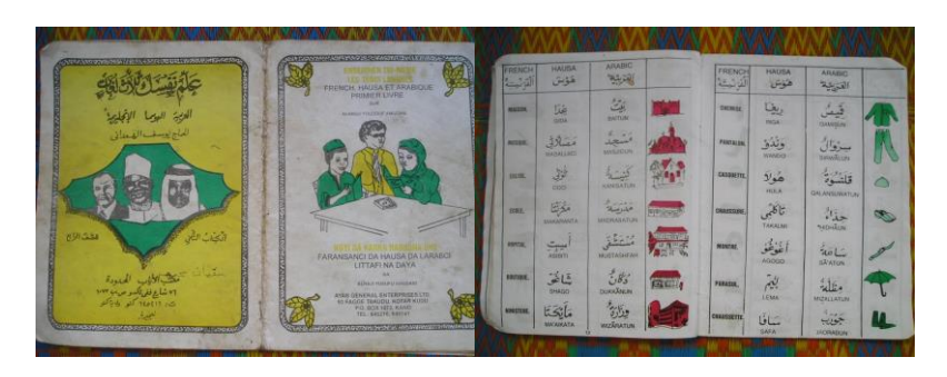
Figure 5: Front and content pages from a primer in three languages and two scripts, Maroua, Cameroon

The figure above shows a bilingual and biscriptual advertisement in Ngaounderé in the top right, a diagram illustrating the many benefits of cattle in Fula Ajami (APES Garoua) on the left, and finally a collection of personal letters in Fula and Hausa Ajami from Garoua in the bottom right.