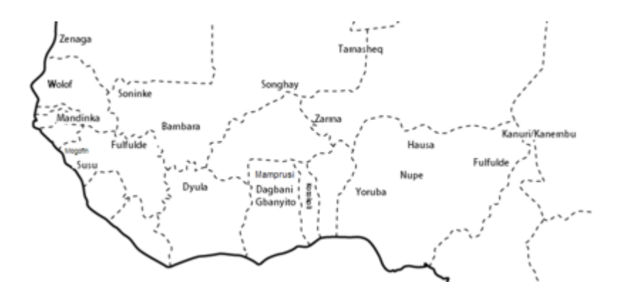
Figure 1: Map of languages for which Ajami use is attested (Souag 2010:1)

The following paragraphs give a brief overview of two well-documented cases of West African languages written in Arabic-based scripts. For the Chadic language Hausa spoken in Nigeria and Niger, the use of Ajami is attested as early as in the 17<sup>th</sup> century (Philips 2000: 19). As Philips remarks, however, "absence of evidence is not evidence of absence", and even earlier writings in Ajami cannot be ruled out, given the difficult climatic conditions for the preservation of manuscripts and difficulties of dating them. Over 20,000 manuscripts in Ajami in the Nigerian National Archives (Philips 2000: 27) are proof of this long and flourishing culture of writing in Hausa. Similar observations as for Hausa hold for the Ajami used for the Atlantic language Fula, spoken throughout the entire Sahel. Not for all countries and dialect areas accounts on the historical importance of writing in Arabic letters are available. Nevertheless, it can be safely stated that pre-colonial Fula literature in Ajami covered religious, political, administrative, poetic and personal texts and was most prolific wherever Fula states existed, as in Senegal, Guinea, and North Cameroon (Seydou 2000: 64-65). For some areas, such as the Futa Jalon in Guinea, a brief history, a catalog of texts ranging from the 18^{th} to the 20^{th} century and a partial evaluation of the contemporary role of the script are available (Salvaing and Hunwick 2003).