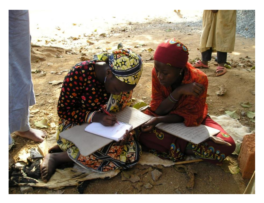
Figure 3: Girls at a Qur'ānic school in Ngaoundéré © F. Lüpke 2004

knowledge in the Arabic script, stressed our interest in Ajami, and vigorously assured interview partners that we were not sent by a government body or an NGO that the first author and her assistant were given access to these schools and had the chance to talk to children and teachers.