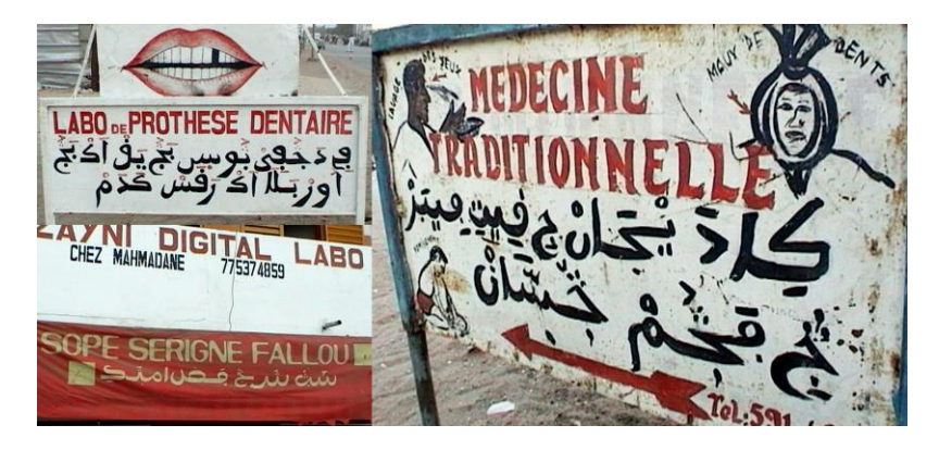
Figure 9: Ajami advertisments in Touba, Senegal