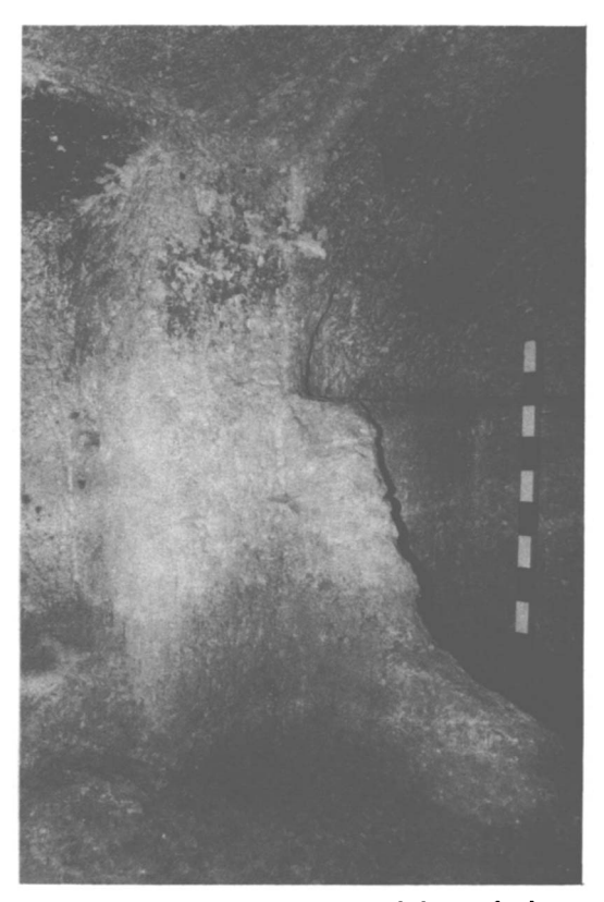
(b) The lower left-hand side of the arch showing Inscriptions I and II in situ.