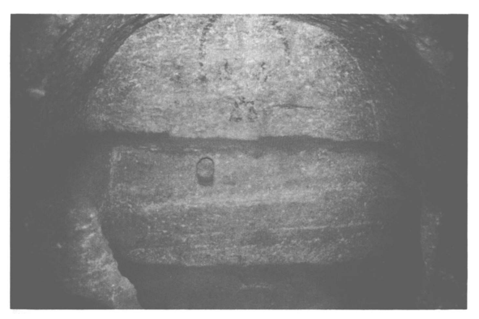
(a) Djebel Khaled. The tomb-chamber showing the bas-relief 'Maltese-type' cross set in a (red) painted wreath.