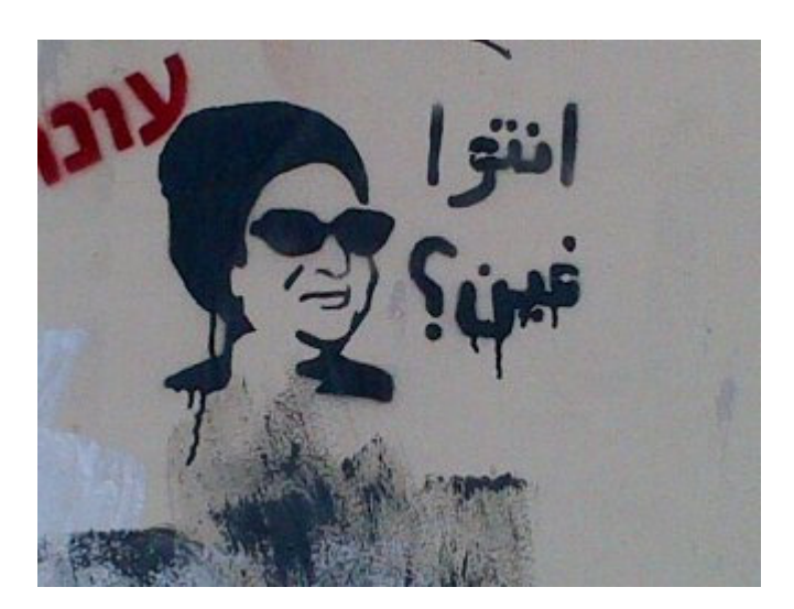
Figure 1. Umm Kulthum's face stamped on a wall as street art in Tel Aviv.

If one follows Josh Kun's directive to listen for buried histories, the sonic cues of ruin are everywhere (Kun 2000). A border between Tel Aviv and Jaffa is fragile not just because the urban geography of the two cities is unstable, but because the sensory experience of the "joined" cities bleeds gradations of Arabic language, culture and ethnicity that traverse and blur the border. With the painful memory of loss from "al-Atlal" as a backdrop to the "fractured synechdoche" (Mann 2015) of the "paper border" (Aleksandrowicz 2013), this article focuses on the way that sound, and particularly the intense sense memory of local sounds, shapes a border that is undefined and largely unpoliced. Employing ethnographic methods of the semi-structured interview, observation, and discourse analysis, the project of analysing the Arab sounds of Manshiyya is an attempt to capture the sensory dynamic of ruin.