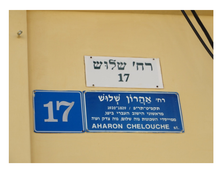
Figure 2. Nameplate for Chelouche Street in Neve Tzedek.

Abu George remembers this, too, and he remembers the way the neighbourhoods around Manshiyya were demarcated ethnically: "On Chelouche there were a lot of Europeans from Poland, that was the centre for Europeans. Shabazi was mixed." (Interview, February 2018, Jaffa).