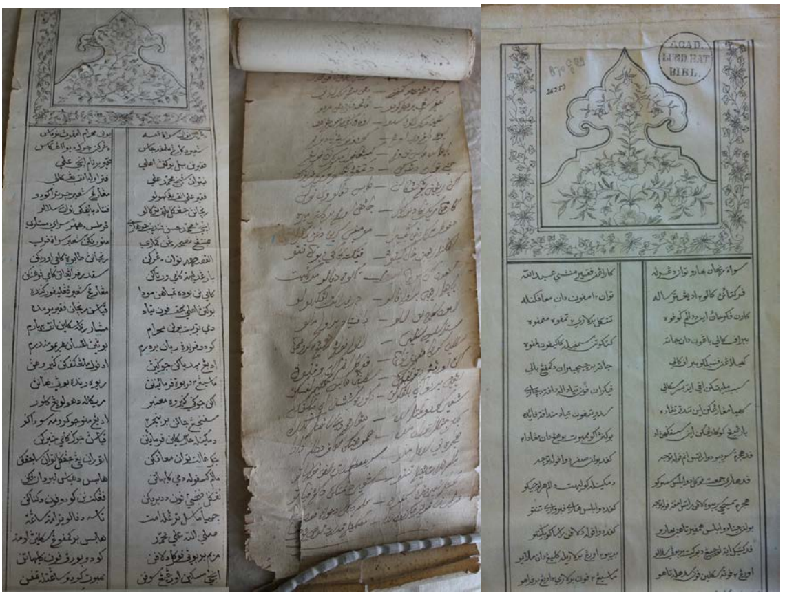
Figure 1 Left to right: 1a and 1b Opening and final lines of Syair Tabut ; 1c Opening lines of Syair Kampung Gelam Terbakar.

Accepted version downloaded from SOAS Research Online: http://eprints.soas.ac.uk/24486/