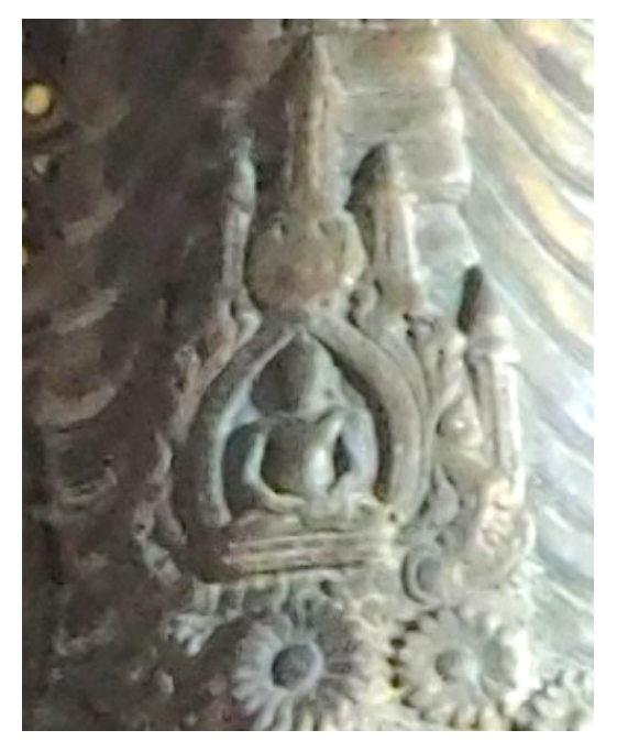
Figure 11. Lokeśvara (Amitābha detail), Mañjunātha Temple.