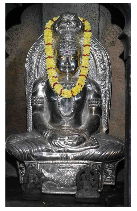
Figure 13. Matsyendra, Mañjunātha temple, Kadri.

Valle in 1624 CE.<sup>102</sup> There are meditation caves at the monastery which date to approximately the 12th to 13th centuries CE.<sup>103</sup> The oldest inscription in the temple courtyard is dated śaka 1308, i.e., 1385 or 1386 CE.<sup>104</sup> Today the temple is in the control of Mādhva priests and the Nāth presence is confined to the monastery,<sup>105</sup> but three stone statues in the middle of the south, west and north exterior walls of the inner shrine of the temple which sport yogi iconography (earrings, jațā and, for two of them, a cross-legged seated position) are said in accompanying labels to be Matsyendranātha (Figure 13), Gorakṣanātha (Figure 14) and Cauranginātha (Figure 15).<sup>106</sup>