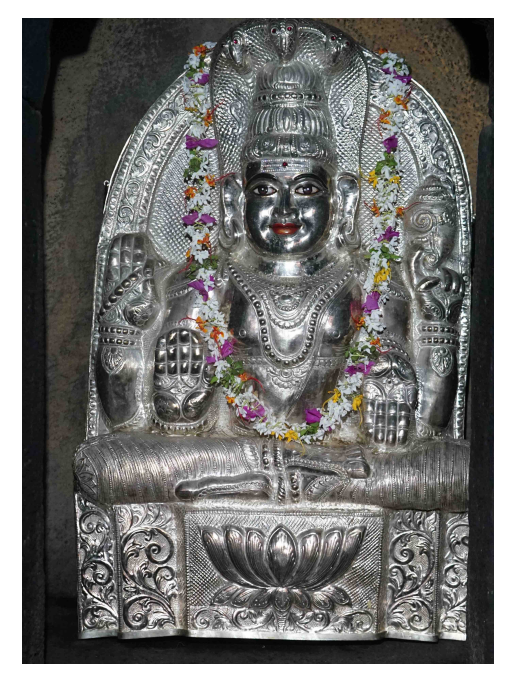
Figure 14. Caurangi, Mañjunātha temple, Kadri.