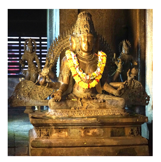
Figure 4. Mañjuvajra, Mañjunātha temple, Kadri.

iconography, however, is clearly Buddhist. The statue on the inscribed plinth is worshipped as Brahmā, but is in fact a form of the Bodhisattva Mañjuśrī, most likely Mañjuvajra (Figure 4).<sup>95</sup>