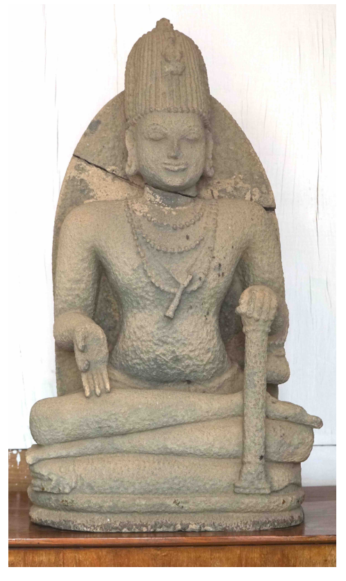
Figure 7. Matsyendra, Mangalore Museum.

In the Mangalore Museum is a stone statue of Matsyendranātha, the first human guru of the Nāth saṃpradāya (Figure 7).<sup>99</sup> The statue is said in its label to be from the Kadri monastery and is cracked across its neck, which may account for its having been removed from its original location.