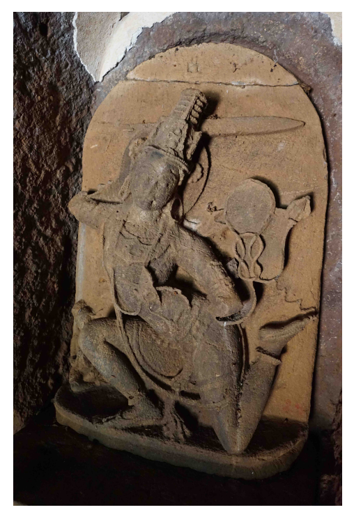
Figure 3. Acala, Panhale Kaji cave 10.

Buddhism was well established in the Konkan when Hsüan-Tsang visited the region in the seventh century,<sup>60</sup> and Vajrayāna had a small but significant presence there and in surrounding areas from the sixth to thirteenth centuries, and perhaps later. Sixth-century statues of Tārā and Avalokiteśvara are found in the western Deccan.<sup>61</sup> The colophon of the ninth-century Cakrasaṃvarapañjikā of Jayabhadra (who was also known as Koṅkaṇapāda) says that its author visited a temple of Tārā at the Konkan site of Mahābimba.<sup>62</sup> A statue of Mañjughoṣa from the Kadri monastery but now in the Mangalore government museum dates to the ninth century or earlier.<sup>63</sup> One of the 29 caves at Panhale Kaji contains a tenth-century image of the Vajrayāna deity Acala (Figure 3).