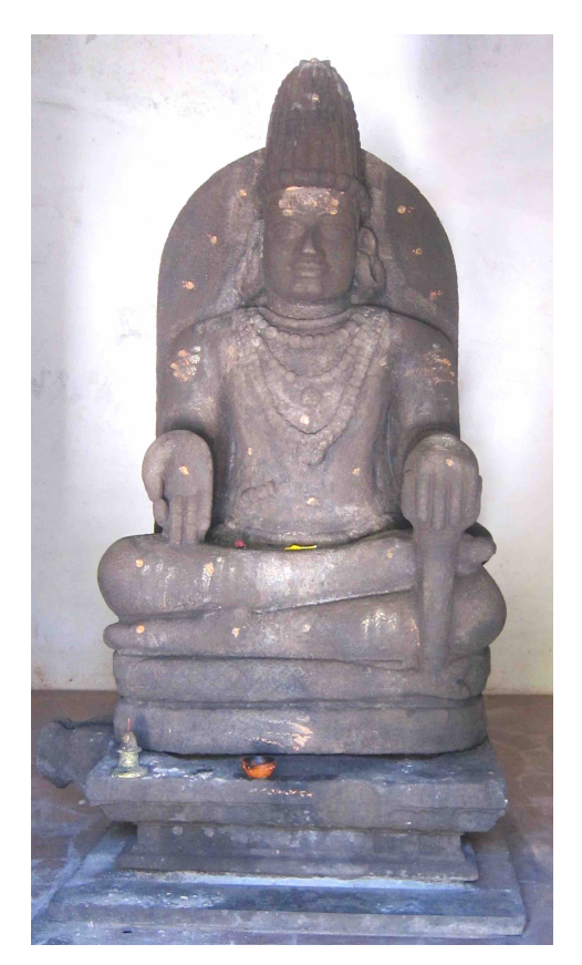
Figure 8. Kadri Monastery, Matsyendra.

There are two small but significant differences between the two Matsyendra images. In both statues Matsyendra wears on a thread around his neck a singī , the small horn signifying membership of a Nāth lineage. That on the older statue is shaped like an antelope's horn, while that on the later statue is a whistle like that worn by yogis of today's Nāth saṃpradāya . Mughal miniatures depict the earlier style of horn from the mid 16th-century onwards; the whistles are not seen until the 18th century.<sup>101</sup> On its label in the museum, the older image is dated to the 10th century. I do not know the grounds for this dating, but Bhatt (1975, plate 302(b)) gives the same date so may be its source. He accepts the incorrect reading ° gate found in the published transcription of the inscription on the plinth of "Lokeśvara" (i.e., Mañjuvajra) so takes the image to be dated 968 CE and proposes the 10th-century date for Matsyendra because he believes the Nāth tradition to have predated Buddhism at the site. I see no need to propose such an early date for the Matsyendra image in the Mangalore Museum. The other difference between the two images of Matsyendra is that the icon on the crown of jațā on the older image is unclear (Figure 9), unlike that of the newer one (Figure 10).