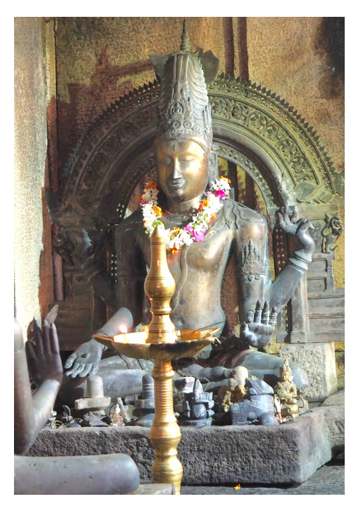
Figure 5. Lokeśvara, Mañjunātha temple, Kadri.

The bronze worshipped as Vyāsa is the Buddha, in a form which closely matches Sri Lankan, Tamil and some Southeast Asian Buddha images; his seated position with the legs half-crossed ( sattvaparyarika ) rarely occurs in Buddha images from India, apart from in the Tamil region (Figure 6).<sup>97</sup>