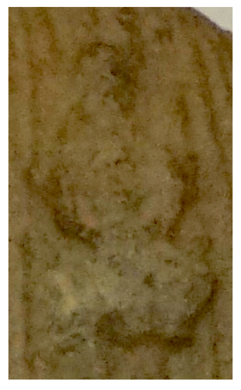
Figure 9. Matsyendra, Mangalore Museum (detail).