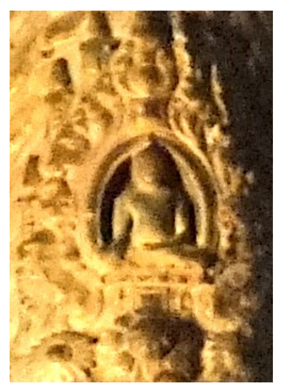
Figure 12. Mañjuvajra (Aksobhya detail), Mañjunātha Temple.

The 1068 CE inscription on the plinth supporting the image of Mañjughoṣa at the Mañjunātha temple says that an image of Lokeśvara was established in the Kadirikā vihāra , i.e., a Buddhist monastery at Kadri. No mention of a separate temple is made in the inscription, but today there are two sites at Kadri, the Mañjunātha temple and, a few minutes walk up a neighbouring hill, the Kadri mațha or monastery. It is unclear whether the Kadri temple and monastery have always been separate sites. The first reference to the existence of both is from the report of a visit to Mangalore of Pietro della