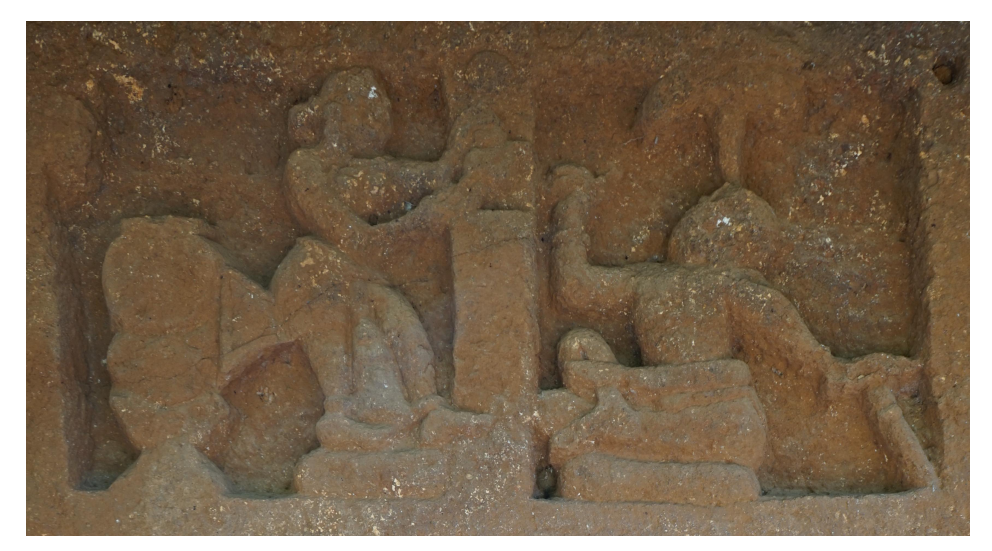
Figure 2. Virūpākṣa, Panhale Kaji cave 14.

Only one Indian Buddhist text other than the Amṛtasiddhi mentions Virūpākṣa: the Caryāgīti , a c. 11th-century collection of fifty middle Indic dohā verses attributed to various siddhas . One of its dohā s is by Biruā (i.e., Virūpa/Virūpākṣa), who, in highly esoteric language, summarises a yoga method which is similar to that of the Amṛtasiddhi but is couched in a metaphor of alcohol production