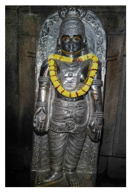
Figure 15. Goraksa, Mañjunātha temple, Kadri.

Bhatt dates these images to the 14th or 15th century,<sup>107</sup> which seems plausible and renders the ascription of a date of the 10th-century to the image of Matsyendra in the Mangalore Museum even more unlikely, since that statue has the singī or horn otherwise found only in north Indian depictions of Nāth yogis from the 15th century onwards, and which is not found on the three images in the