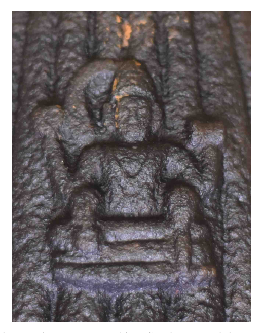
Figure 10. Matsyendra, Kadri Monastery (detail).