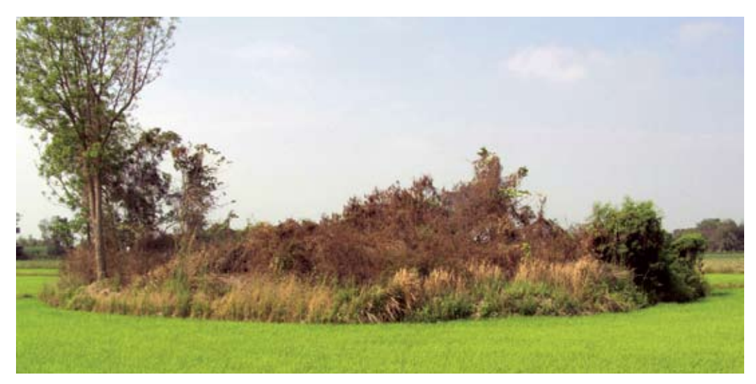
Figure 2. View of Chedi No. 5 in 2010.