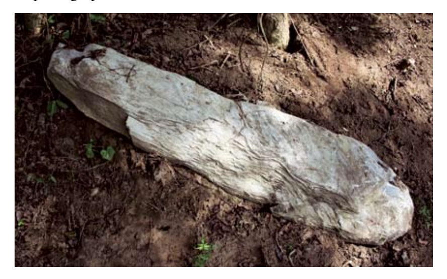
Figure 6. Limestone sema located at MS1.