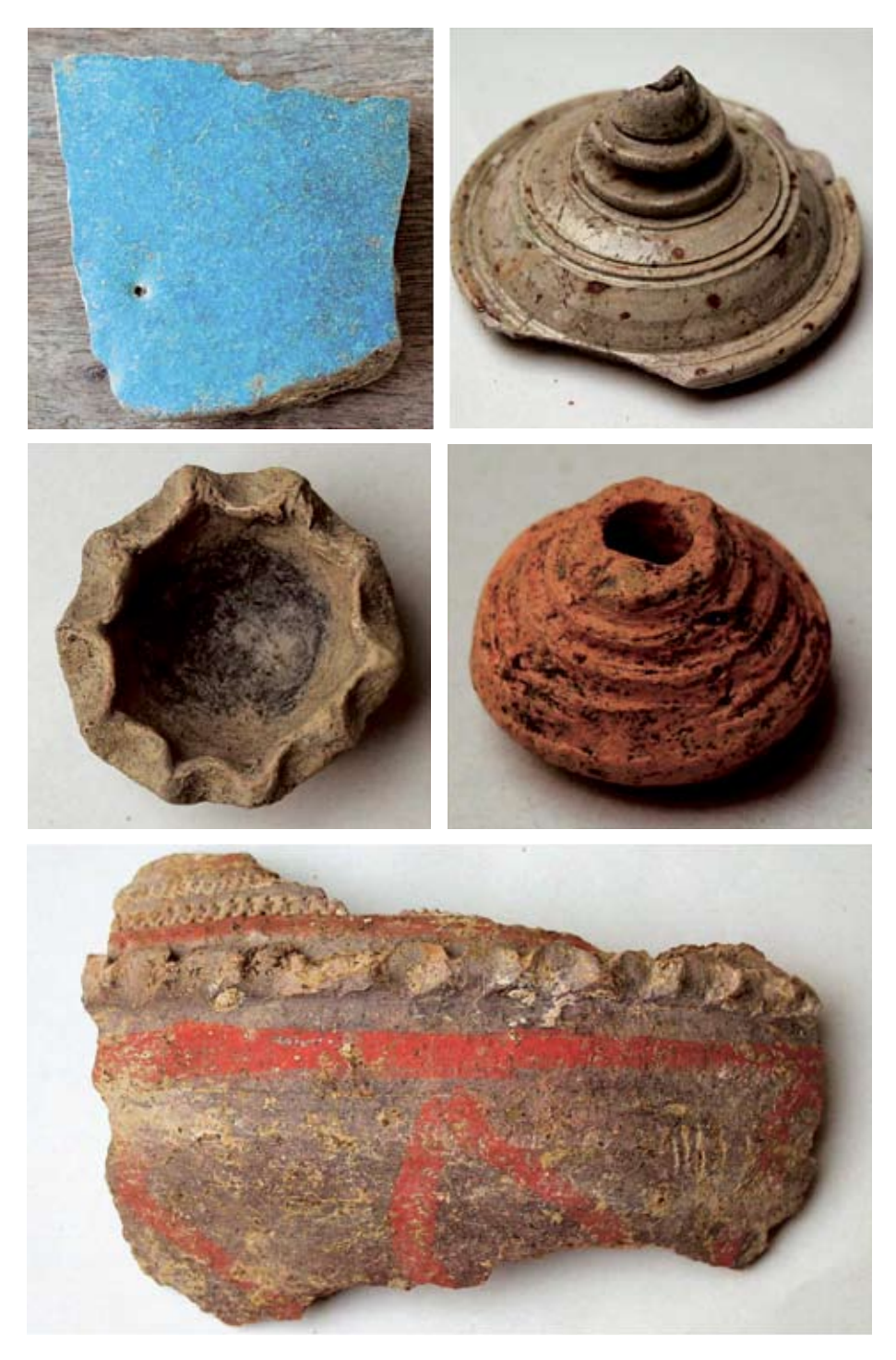
Figure 3. Archaeological objects discovered during the course of excavation in 2009. Clockwise from the bottom: (1) Dvāravatī earthenware pottery, (2) Dvāravatī terracotta oil lamp, (3) Persian ware, (4) green-glazed Angkor-period stoneware, (5) Dvāravatī spindle whorl.