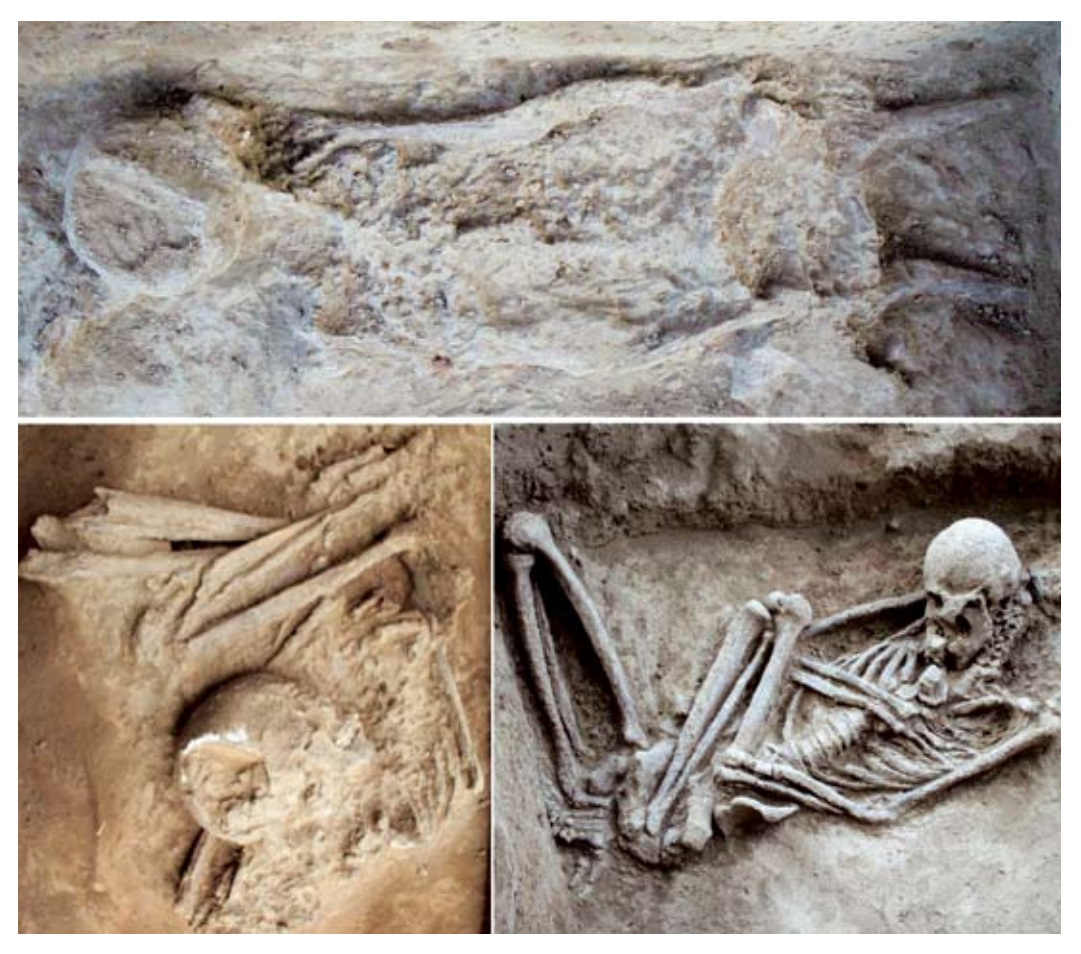
Figure 5. Three types of inhumations discovered at MS1. Clockwise from bottom left: (1) "bag" burial, (2) extended burial, (3) flex burial.