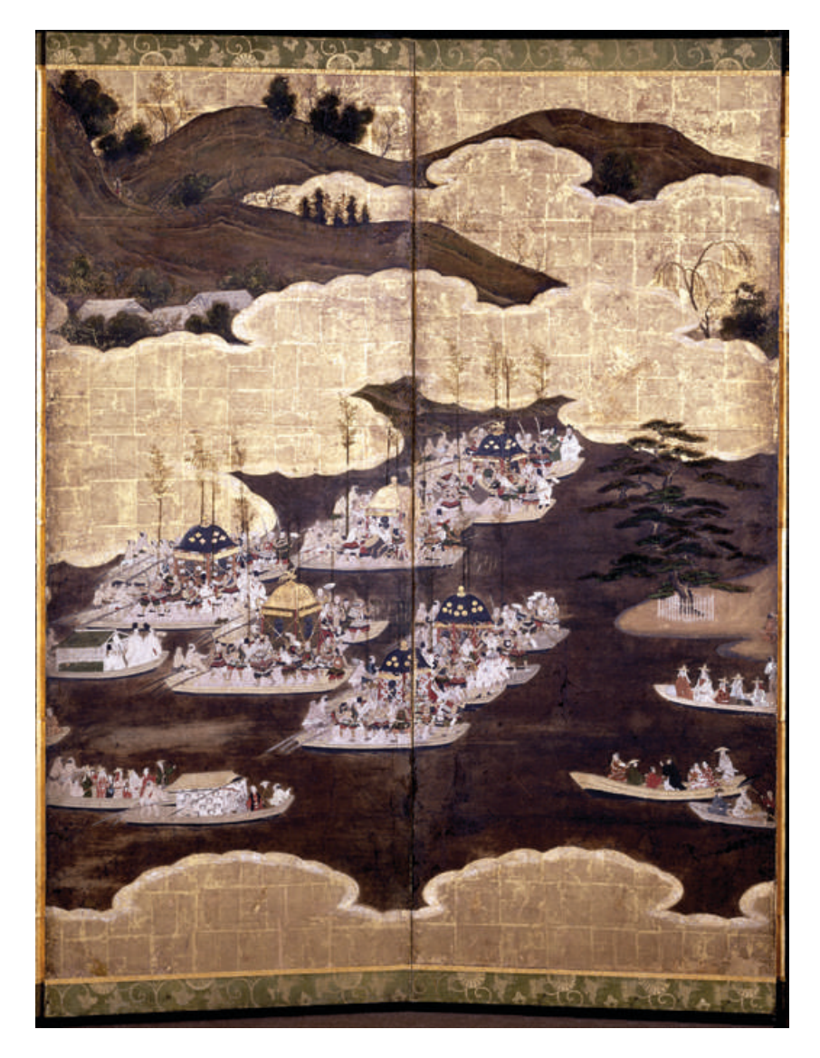
Fig. 4. Portable shrines of the Sannō deities on boats. Details from a pair of six-panel screens illustrating the Hie shrine and its festival. Kanei period (1624–1644).