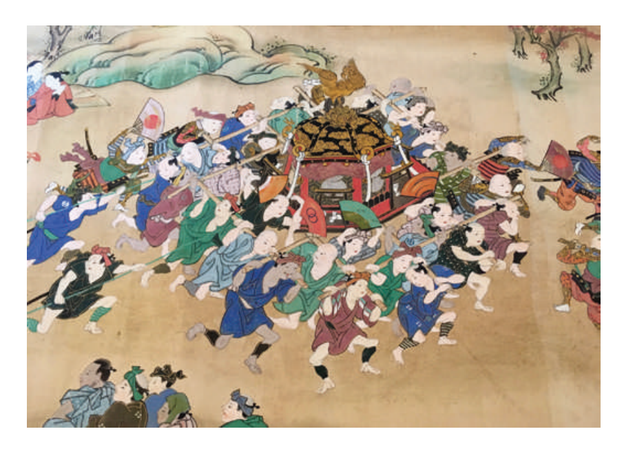
Fig. 3. Sannō kami carried down from the Hie shrine. Details from Hie Sannō sairei emaki , seventeenth century, colour and gold on paper.

In a letter written from the capital on 4<sup>th</sup> October 1571, Luís Fróis provided his superior with further details on the Hie deities and again described the popularity and opulence of the shrine complex and the lavish festival staged on land and water, for which no expense appeared to have been spared. Interestingly, Fróis must have seen such magnificence of places and performances collapse in front of his own eyes, for the letter was written just a few days after Nobunaga had reduced to ashes shrines and non-religious buildings in Sakamoto as well as the temples on Mount Hiei.<sup>114</sup>