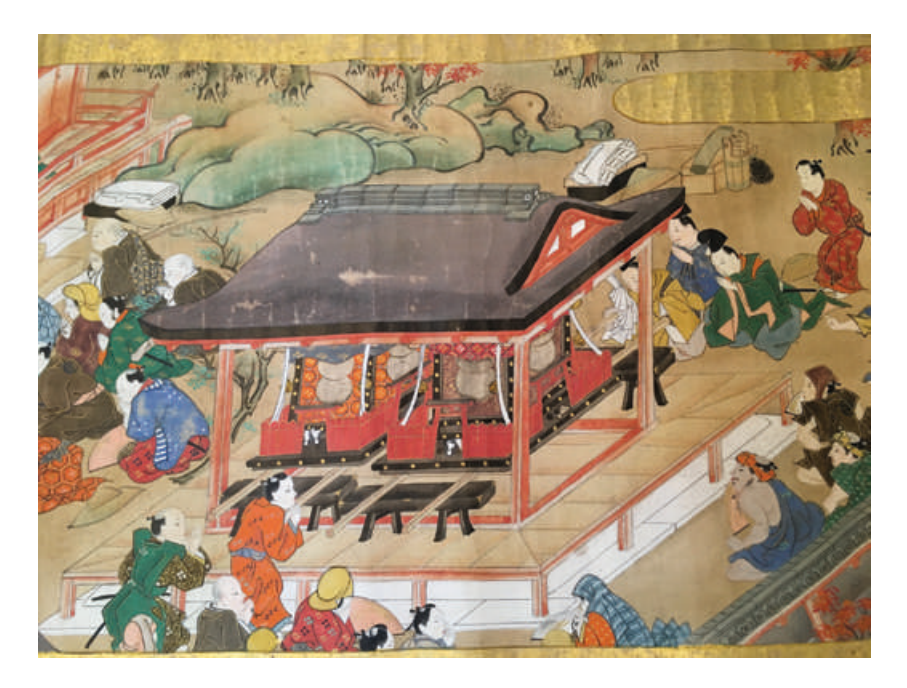
Fig. 2. Venerating Sannō: the portable shrines of the main Sannō deities. Details from Hie Sannō sairei emaki , seventeenth century, colour and gold on paper.

Sannō (lit. 'King of the mountain') is a collective term for the deities protectors of the Tendai school –combinatory entities that were at the same time kami and hotoke . There were twenty-one of them, with seven being considered the central deities.<sup>113</sup> The seven objects Fróis describes are their temporary abodes ( mikoshi ), carried down during the festival in a procession which, today as when the Jesuits observed it, departs from the shrine complex and reaches the banks of Lake Biwa after crossing the town of Sakamoto (Figs. 2 and 3)