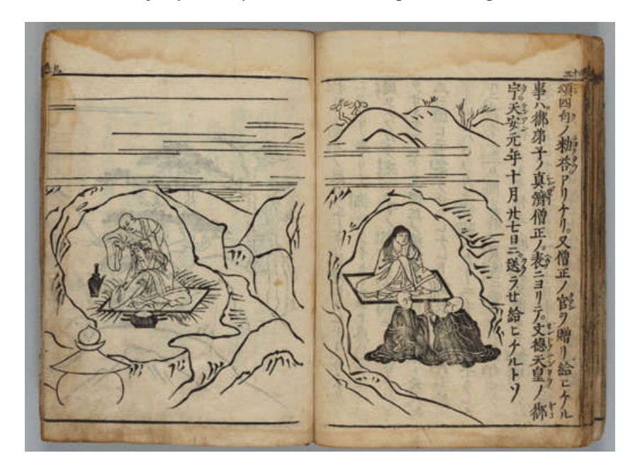
Fig. 1. Kūkai sitting in meditation in the cave where he had been buried. His hair has grown long and one of disciple visiting the cave gives him a haircut. From a Edo period printed version of the Illustrated Deeds of the Great Master of Kōya (Kōya daishi gyōjō zuga 高野大師行狀圖畫).

throughout the medieval period to promote a devotional cult around Kūkai and attract pilgrims to Mount Kōya. For instance, one of the oldest of these tales, the tenthcentury Kongōbuji konryū shugyō engi , recounts that "[Kūkai]'s entry in meditation simply meant that he had closed his eyes and did not speak... Since he was still living like an ordinary person, no funeral was performed... His disciples closed the structure and people had to get permission to enter it."<sup>102</sup> The mysterious afterlife of Kūkai was also depicted in handscrolls, such as the fourteenth-century Illustrated Deeds of the Great Master of Kōya , widely circulated and later printed<sup>103</sup> (Fig. 1).