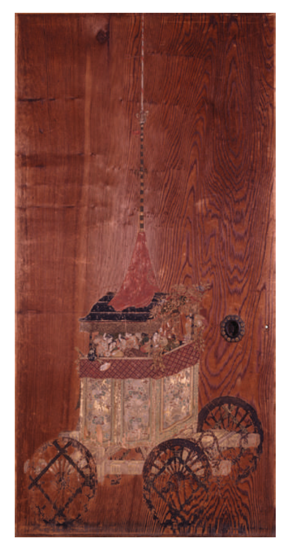
Fig. 5. One of the floats paraded in the Gion festival, Taishi yamaboko. Detail of a door, seventeenth century, colour on wood. Attributed to Kanō Atsunobu.