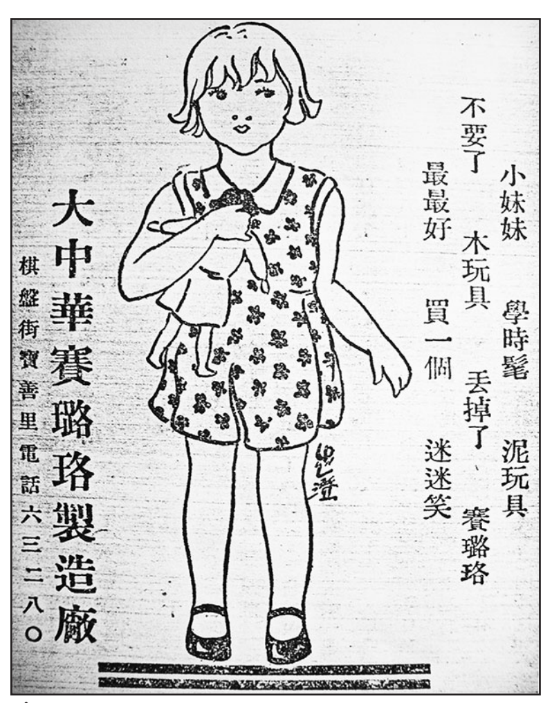
Figure 1. Da Zhonghua sailuluo advertisement, Jilian huikan no. 14 (1930): 25.