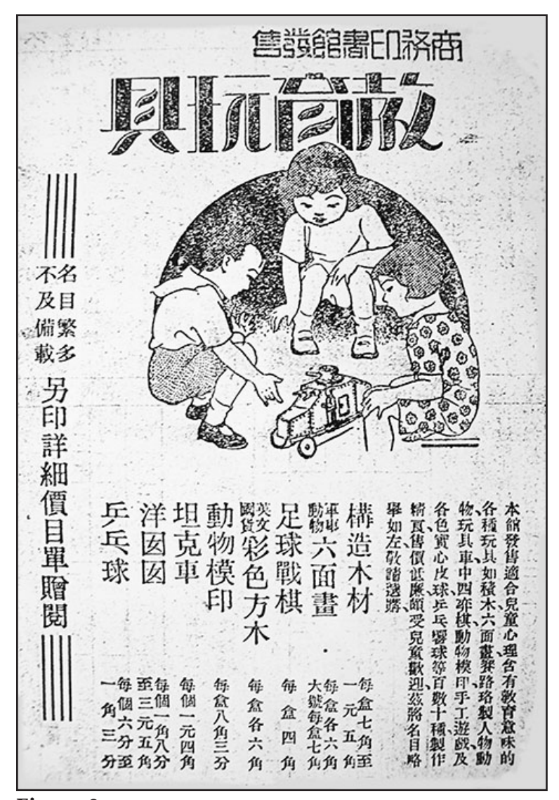
Figure 8. Shangwu yinshuguan advertisement, Ertong shijie 30, no. 9 (1933): n.p.