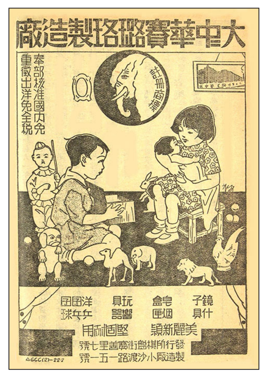
Figure 4. Da Zhonghua sailuluo advertisement, Ertong shijie 30, no. 7 (1933): n.p.