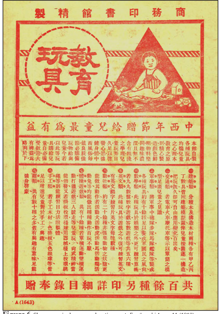
Figure 6. Shangwu yinshuguan advertisement, Funü zazhi 4, no. 11 (1918): n.p.