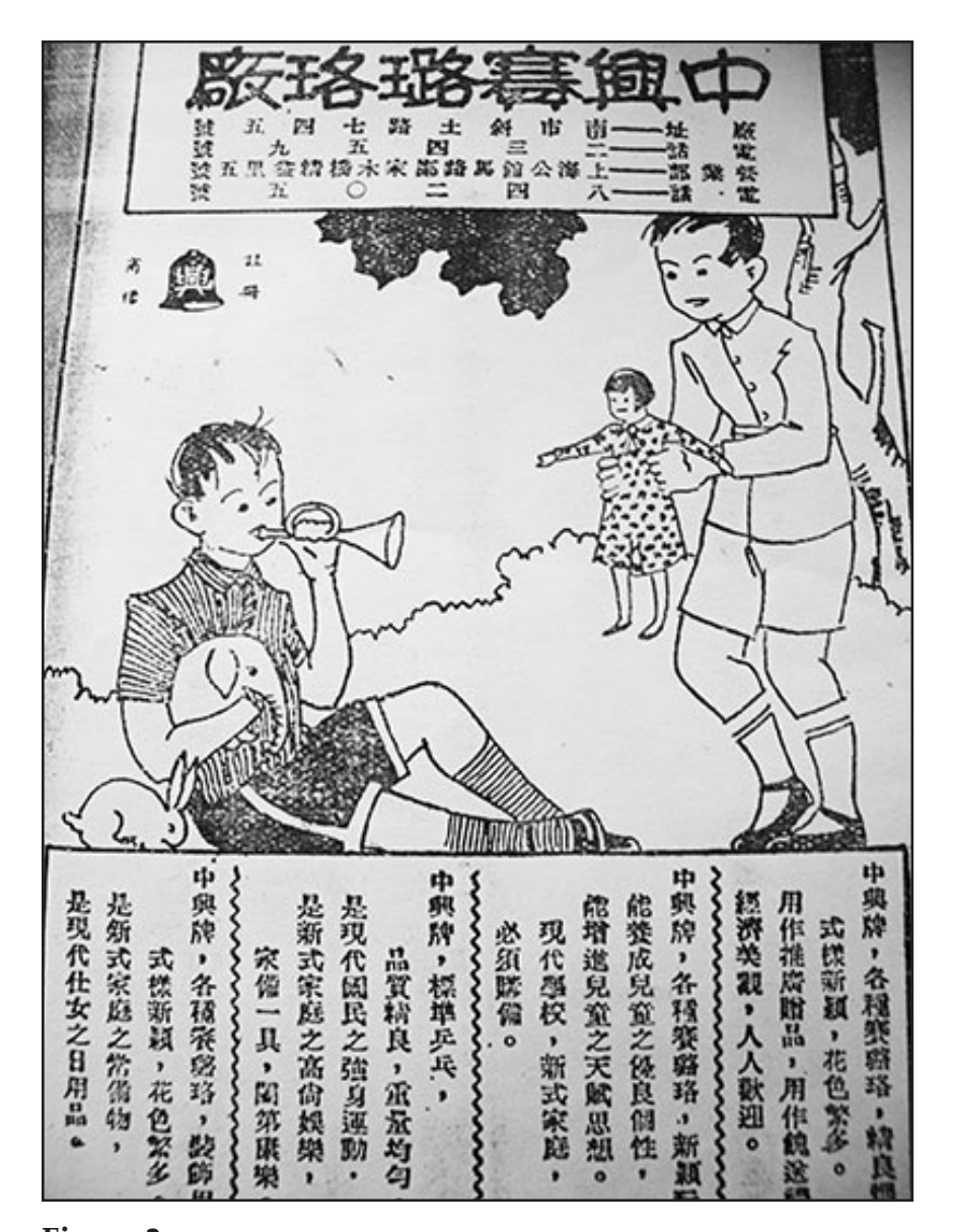
Figure 2. Zhongxing sailuluo advertisement, Jilian huikan no. 94 (1934): 44.