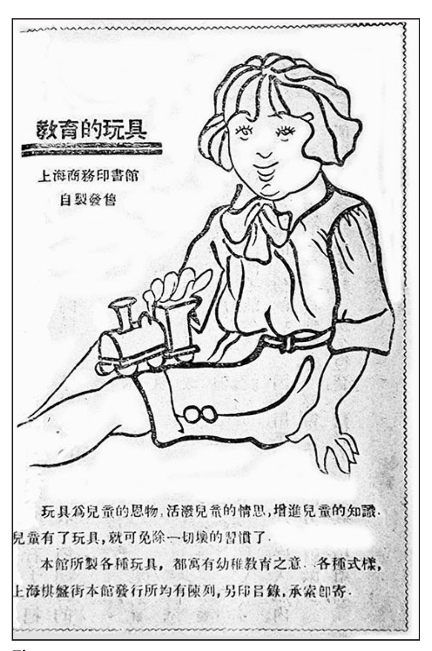
Figure 7. Shangwu yinshuguan advertisement, Shaonian zazhi 12, no. 9 (1922): n.p.