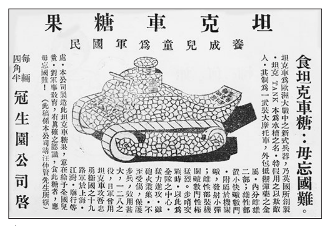
Figure 9 . Guanshengyuan gongsi advertisement, Xiandai fumu 1, no. 1 (1933): n.p.