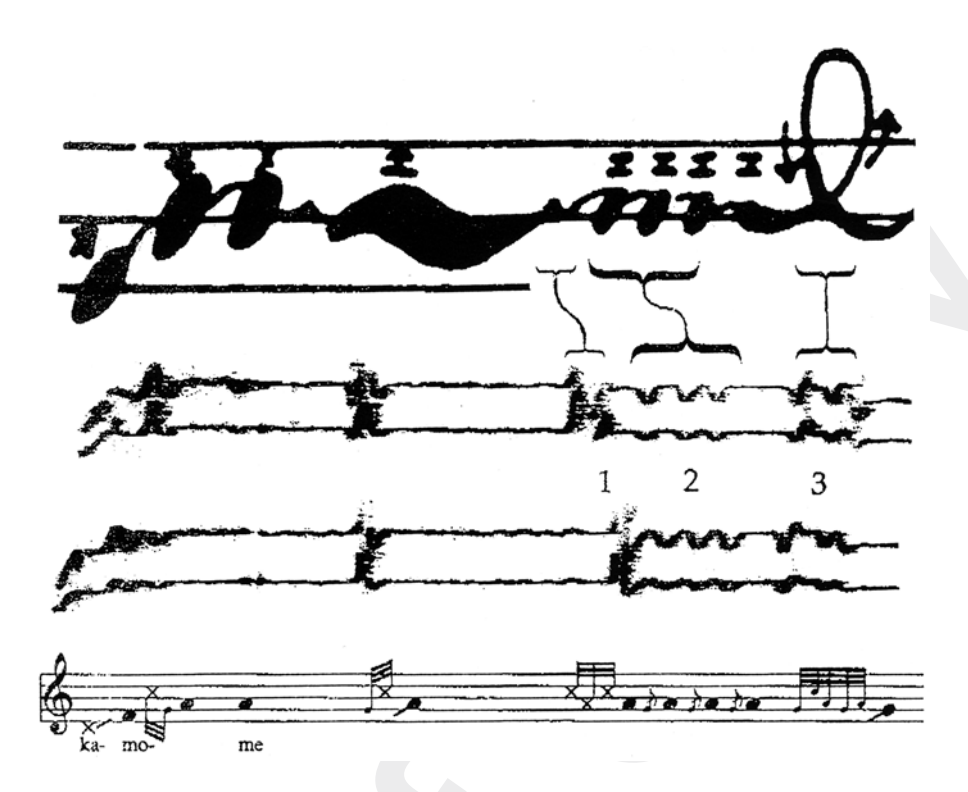
Figure 12.4 Opening of Esashi oiwake : official notation; sonogram; staff transcription. (From Hughes 1992: Figure 5)

century, under Romantic inspiration (Hughes 1991; CD Tōkyō ondo , 1997). The older style, flourishing during the 1920s and '30s, was mobilized for social engineering (see below), for local pride and rivalry, and for tourism advertising. Hundreds were produced, most commissioned by a local community or perhaps a railroad company. Thus the lyrics – usually by urban-based poets – touted local products or scenic spots. Both lyrics and tunes were relatively close to traditional dance songs, using a simple 2/4 or 6/8 metre and traditional modes. Vocal style was relatively traditional, although sometimes a singer trained in bel canto would be hired to imitate a folk-style voice (this is better imagined than heard!). Accompaniment mixed traditional and Western instruments, suiting the evolving musical tastes of a new Japan. Some of these songs are integrated into today's standard min'yō repertoire – such as Chakkiri bushi , ironically the only well-known min'yō from Shizuoka prefecture – but most are never heard.