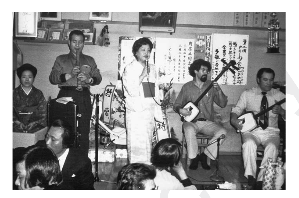
Figure 12.1 Folk song bar Yoshiwa in Osaka, with typical ensemble – from left: taiko (behind screen to reduce volume), shakuhachi , two shamisen . This singer is a professional, but customers also take turns singing with the 'house band'.

favoured to accompany the powerful songs of the old Tsugaru region of Aomori Prefecture in the far north; a solo shamisen genre of this name has spun off from such accompaniment, of which more below. Differences from the thick-necked instrument of bunraku puppet theatre include, for example, a lighter and lower bridge and thinner-tipped plectrum (to facilitate the rapid, highly ornamented plucking of the northern style) and a much thinner treble string (giving a delicate sound contrasting with the thundering bass string). The 'thin-necked' ( hosozao ) variety of the geisha or kabuki nagauta is also widely used in min'yō , especially for songs more associated with the geisha. The intermediate-size chūzao provides a useful compromise. Tuning is as for other genres.