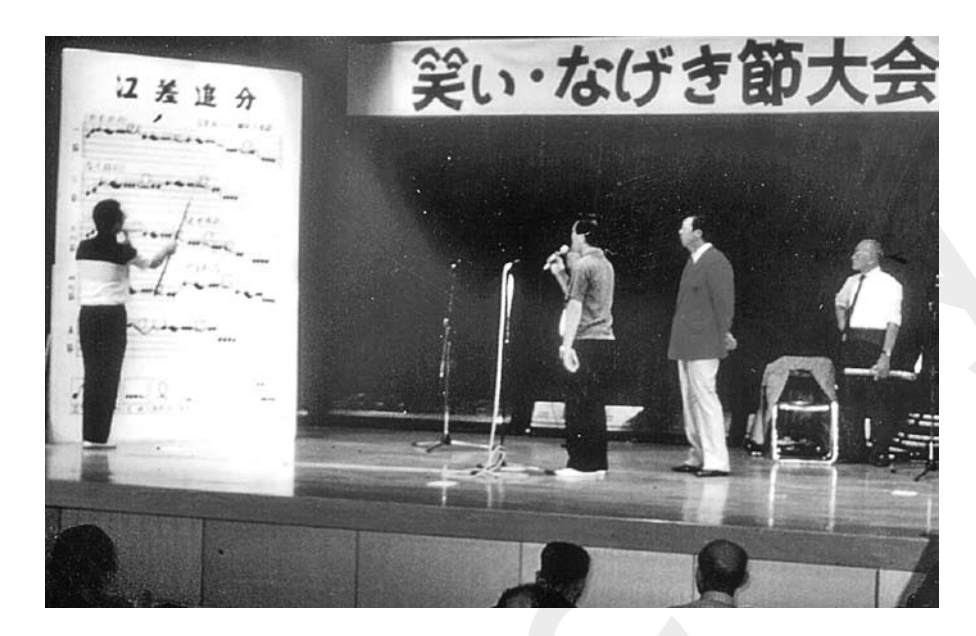
Figure 12.3 Teaching Esashi oiwake at the Esashi Oiwake Kaikan museum. Photo D. Hughes 1998

a pack-horse driver's song, or by a device to imitate the creaking of an oar in its housing for a rowing song. A solo singer stands centre-stage, with backup singers behind if necessary.