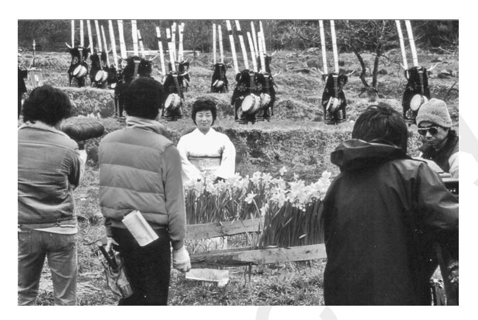
Figure 12.5 Shishi odori being televised, Kuryūzawa, Iwate Prefecture.

native deities to grant prosperity and long life; many items in this large and diverse category present stories from Shinto mythology. Dengaku, 'rice-paddy music', covers events linked to rice agriculture, from re-enactments of the entire annual cycle to guarantee a good crop, to music for ritual transplanting of seedlings (for example \odot track 30; example also at the end of the film The\ Seven\ Samurai ). Fury\bar{u} are mostly large-scale events held in summer (including Bon dances), again asking or thanking the gods for assistance; many festivals (matsuri) centre around them. Others of Honda's subtypes encompass local versions of classical music-theatre and so forth. However, his categories are not watertight, particularly in terms of musical elements.