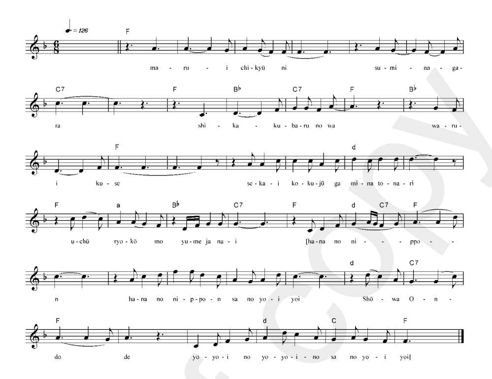
Example 12.2 Shōwa ondo (transcribed from Japan Victor 45 rpm disc; music Yoshikawa Shizuo, lyrics Yoshida Masashi)

have placed their 'tonic' so as to allow easy Western-style harmonization. Second, whereas almost all early shin-min'y \bar{o} started their titles with a place-name, this new wave overwhelmingly bore titles that could embrace all Japanese and even perhaps position them in the world community, appropriately to their new self-image: Peace Song, Happiness Song, Young Folks' Drum. Lyrics teem with a new vocabulary of modernistic optimism: peace, hope, world, spring, young, prosperity, future, tomorrow, cheerful, dream. An example is Shōwa ondo (⊙ track 29; Example 12.2). Recorded in 1981 (during the Showa era), it uses the pentatonic major and – as for virtually all recent shin-min'yō – a danceable 6/8 metre. Verse 1 reminds Japanese that they must have an international, indeed universal conscience: 'Living on this round earth, it's a bad habit to be a ceremonious square. All nations of the earth are neighbours – even space travel is not a dream.' By the final verse, however, national identity has re-asserted itself via potent clichés: 'Mt Fuji, cherry blossoms, you and I, all those unforgettable moments. This is the country where we were born and raised – let's all keep the lamp of hope burning!' These lyrics express perfectly the dilemma of Japanese today. The music does the same, striving to be both Japanese and international (that is, Western).