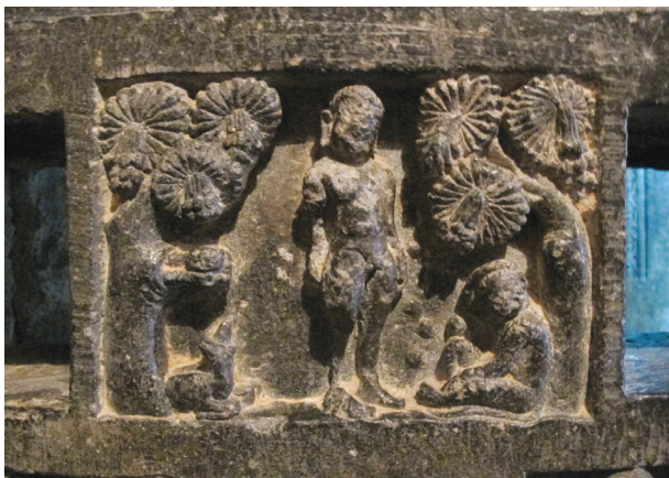
Sallekhanā of a muni under a tree. 10th-century stone relief in the Candragupta Basti in Śravaṇabelagoḷa.