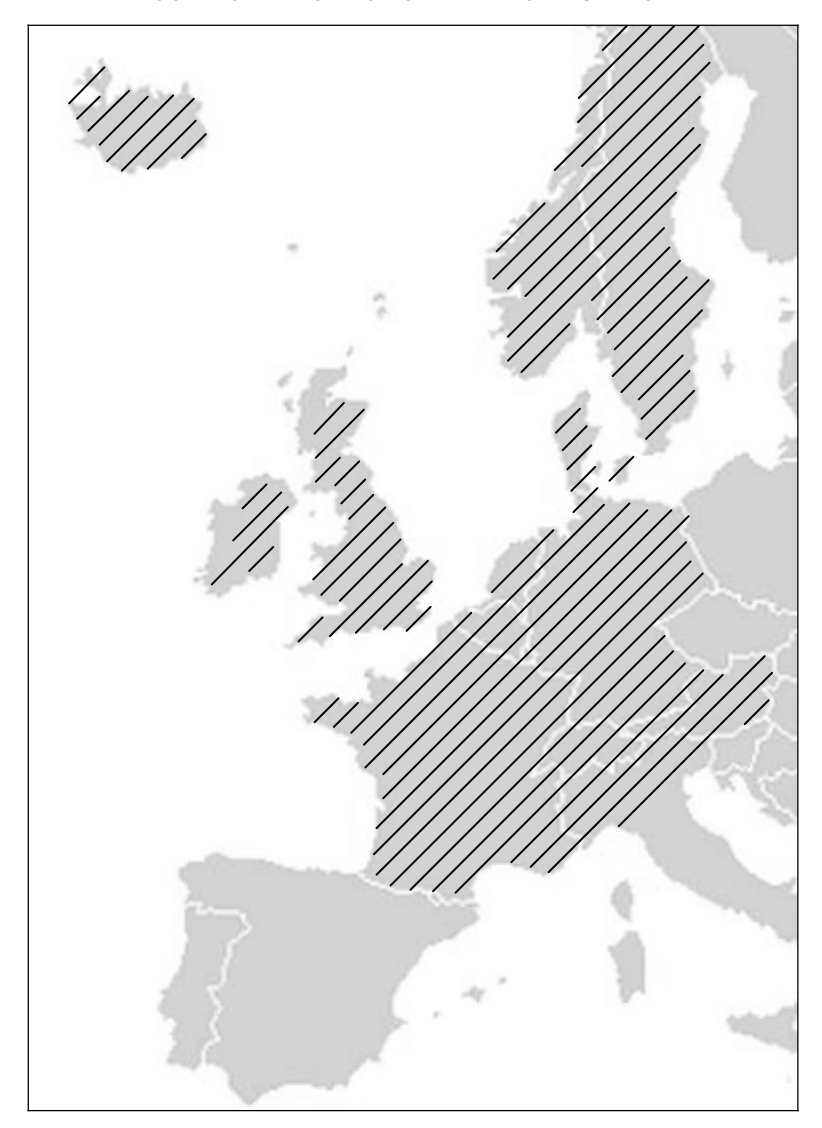
Figure 1 Traditional varieties spoken in the shaded areas have all undergone JC.